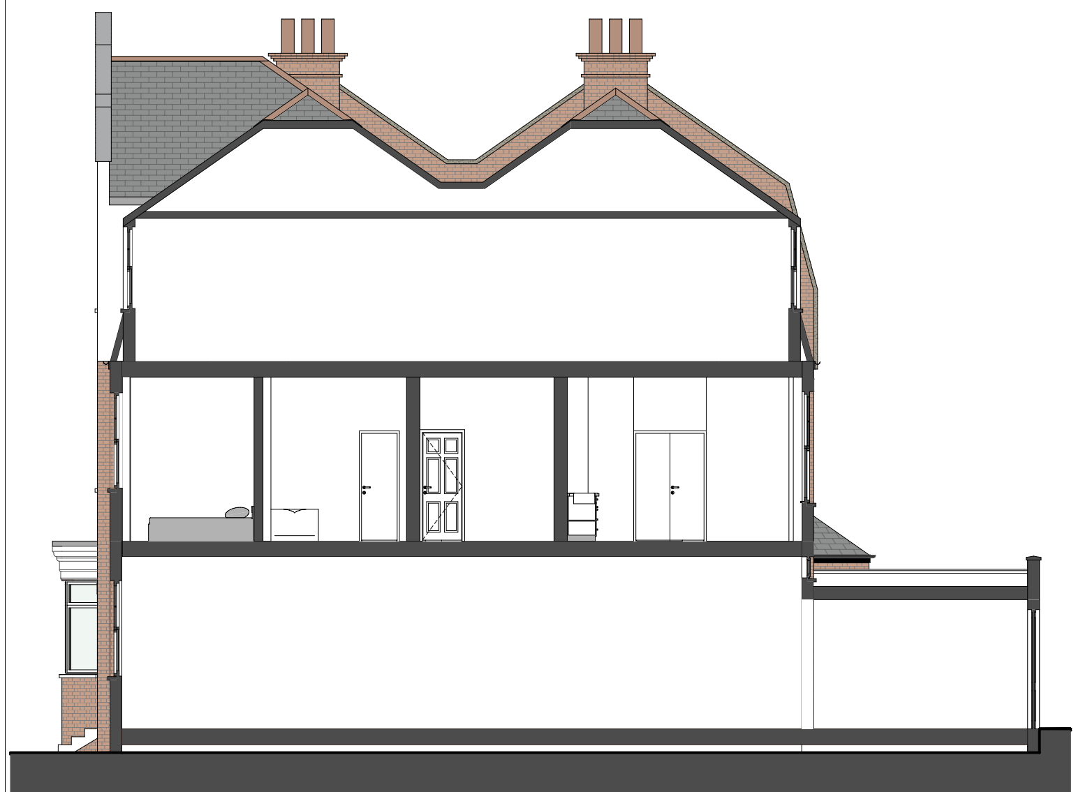
EXISTING SECTION AA SCALE @ A3_1:100