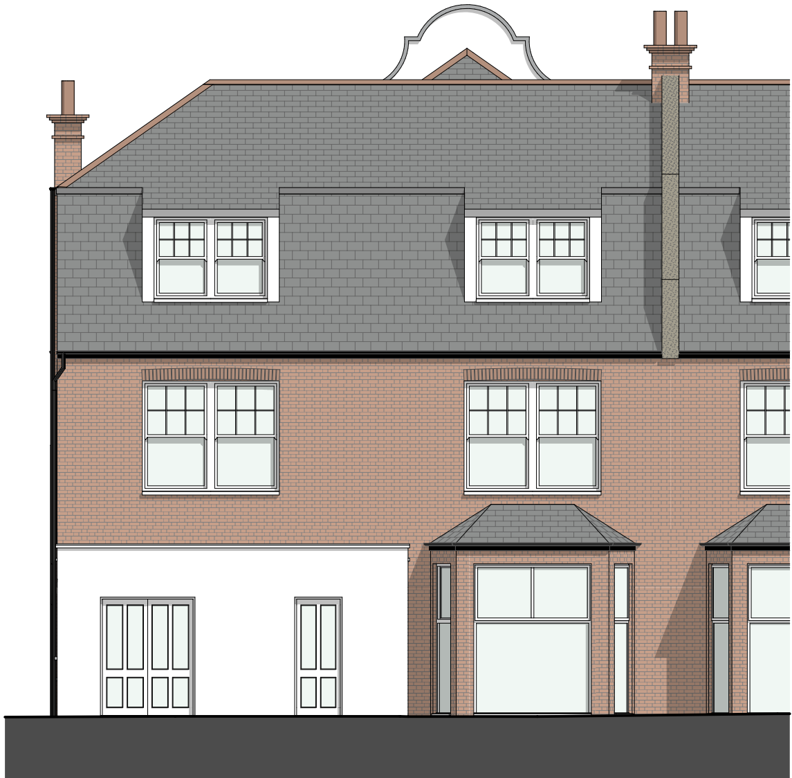
EXISTING ELEVATION 2 SCALE @ A3_1:100