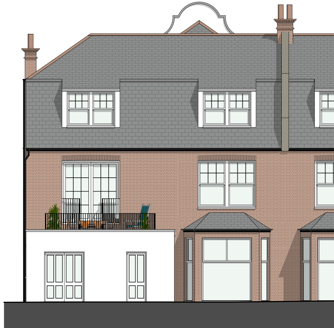
PROPOSED ELEVATION 2 SCALE @ A3_1:100