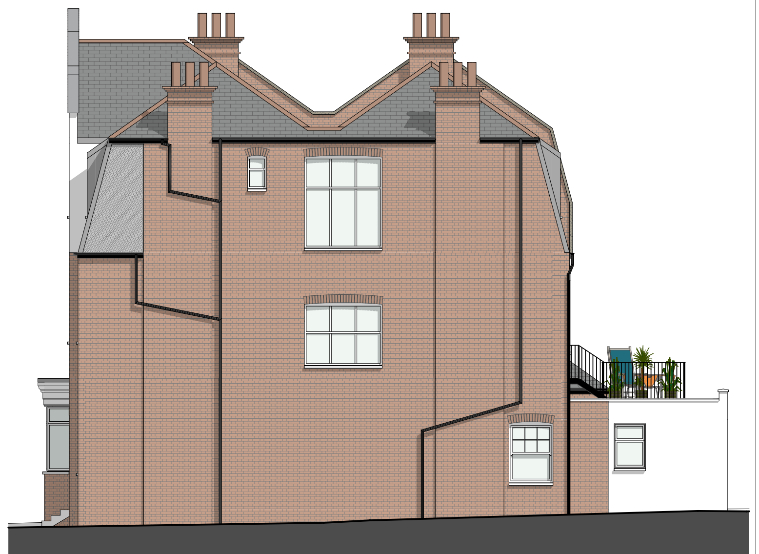
PROPOSED ELEVATION 1 SCALE @ A3_1:100