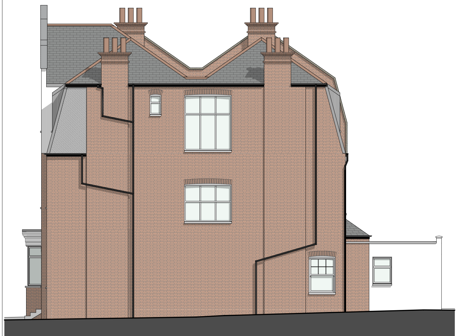
EXISTING ELEVATION 1 SCALE @ A3_1:100