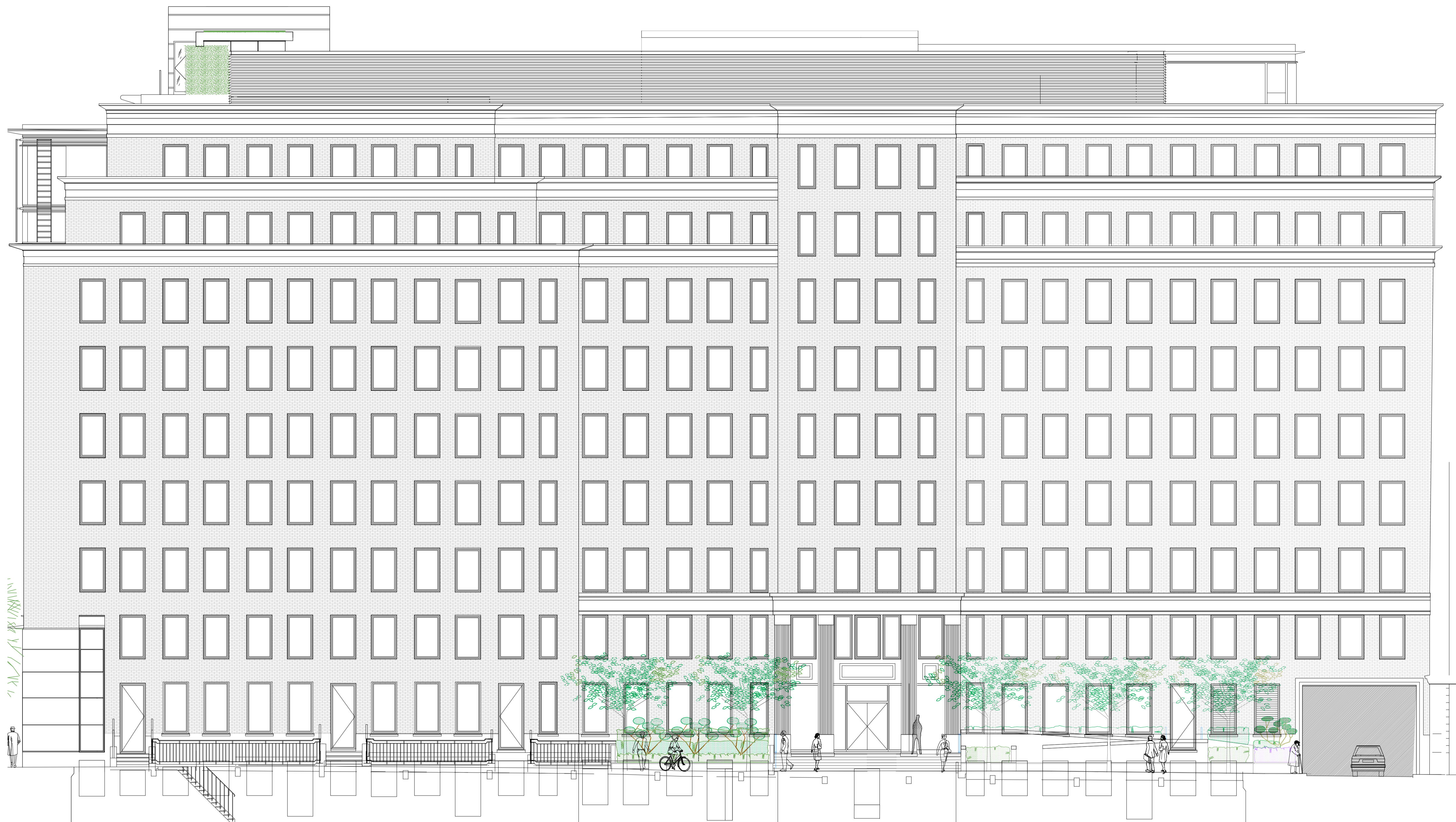
1 East Elevation as Proposed 1 : 100