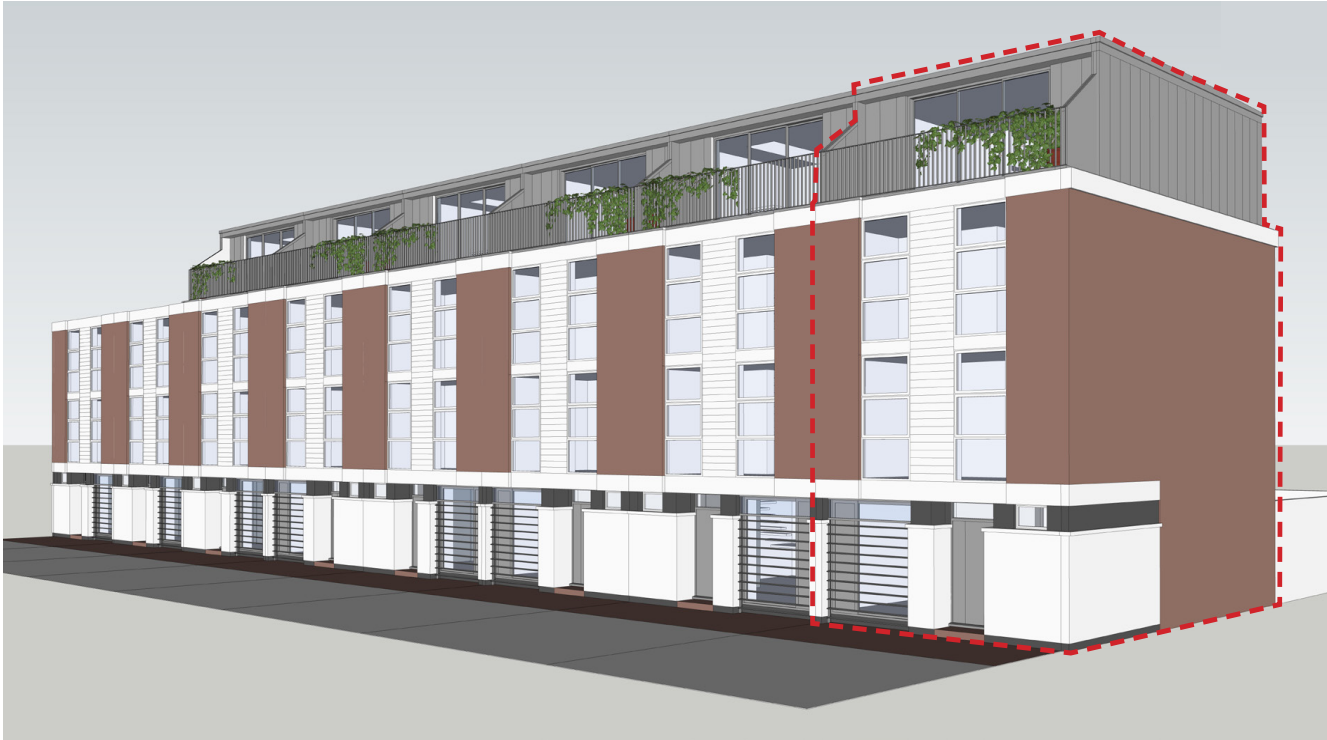
Proposed front (south) elevation of extension to No 15 (highlighted) and Nos. 10-14 (concurrent applications)