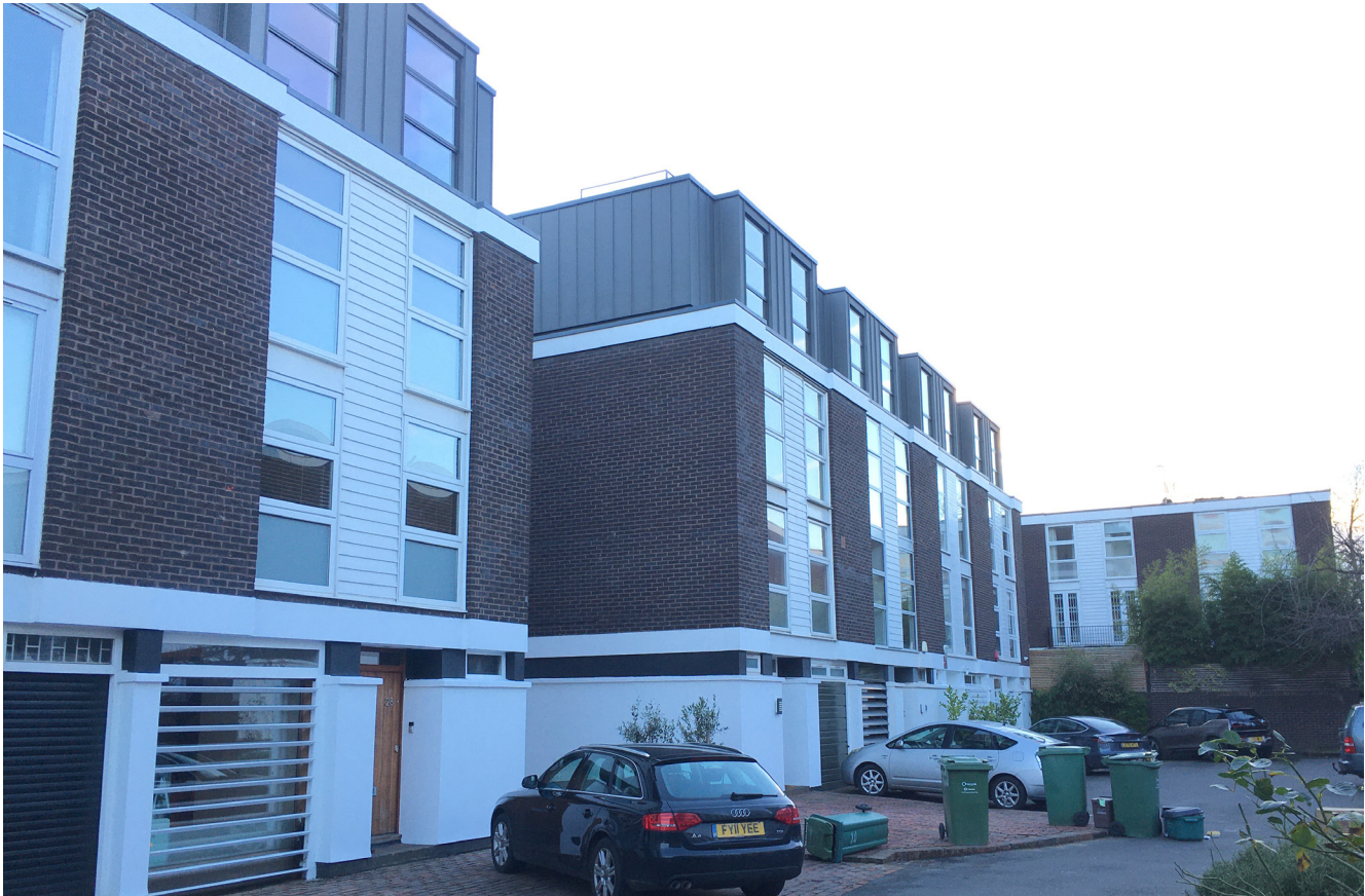
Roof extensions to 24-34 Elliott Square, view from Elliott Square