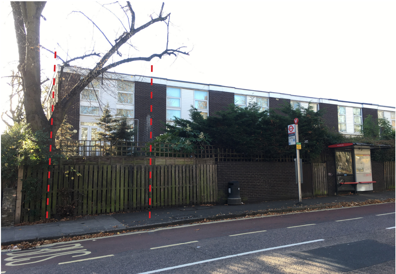
Rear of No 15 Elliott Square, seen from Adelaide Road