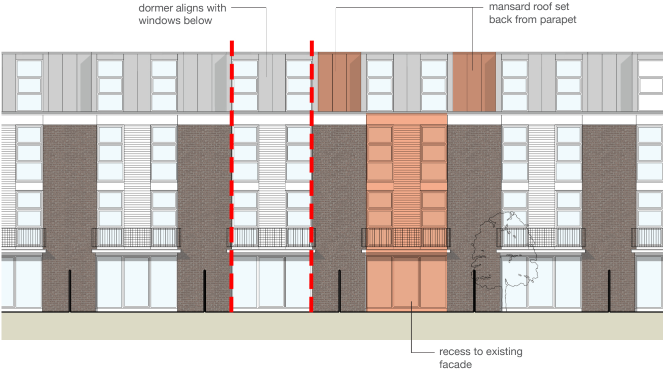
Principles behind composition of proposed rear (north) elevation