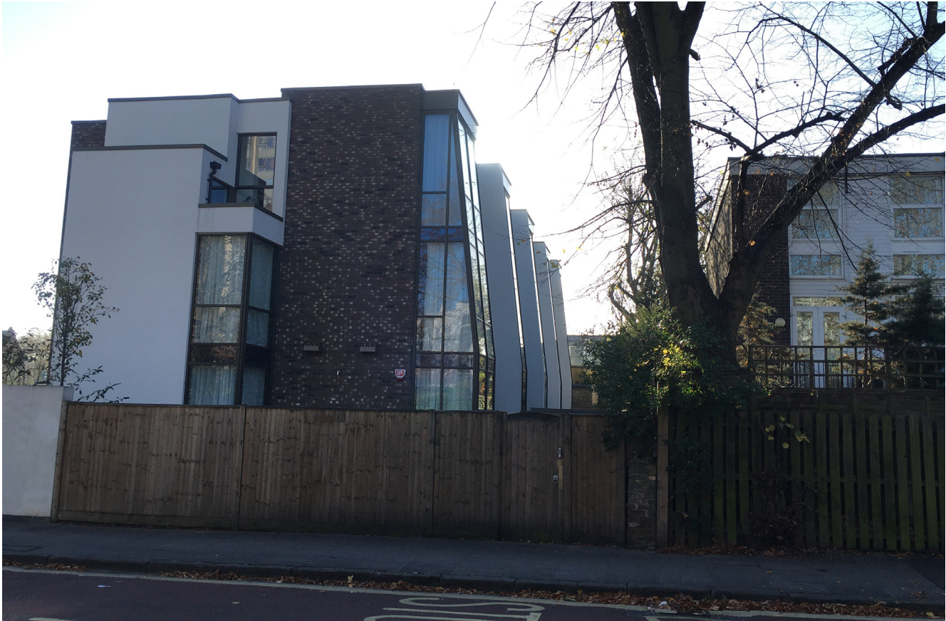
View of 143 Adelaide Road showing relationship to No 15 Elliott Square