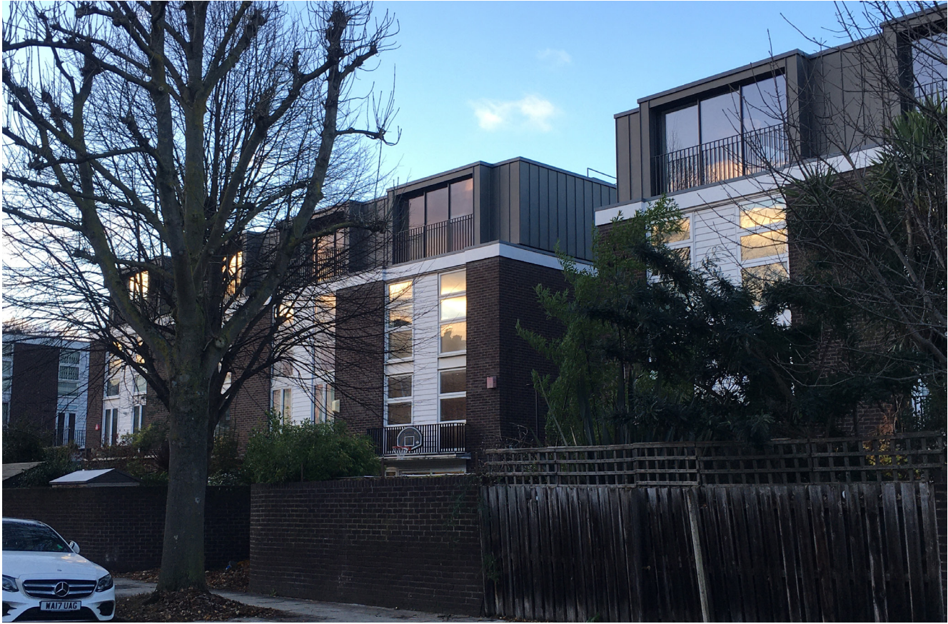
Roof extensions to 24-34 Elliott Square, view from King Henry's Road