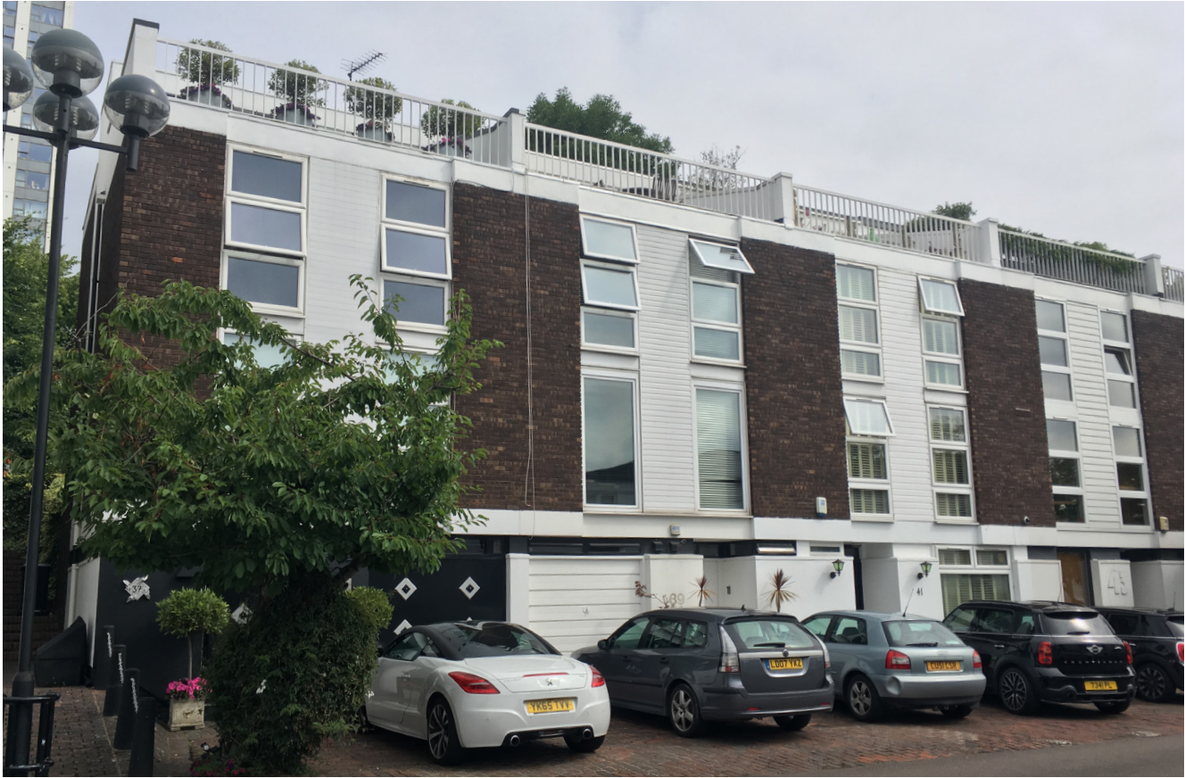
4 storey houses in Quickwood, with south facing terraces on the top floor