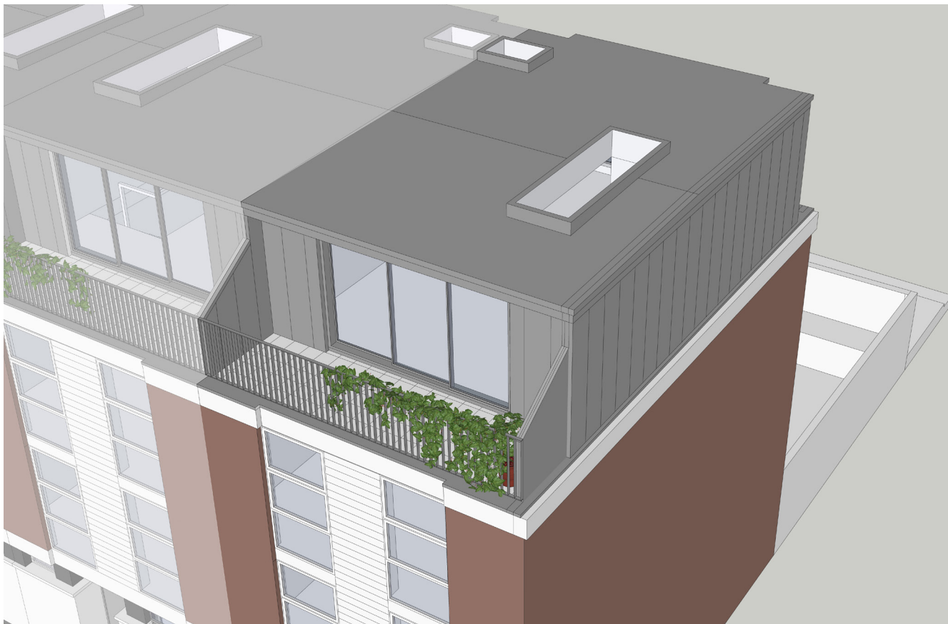
View of Proposed Roof Extension