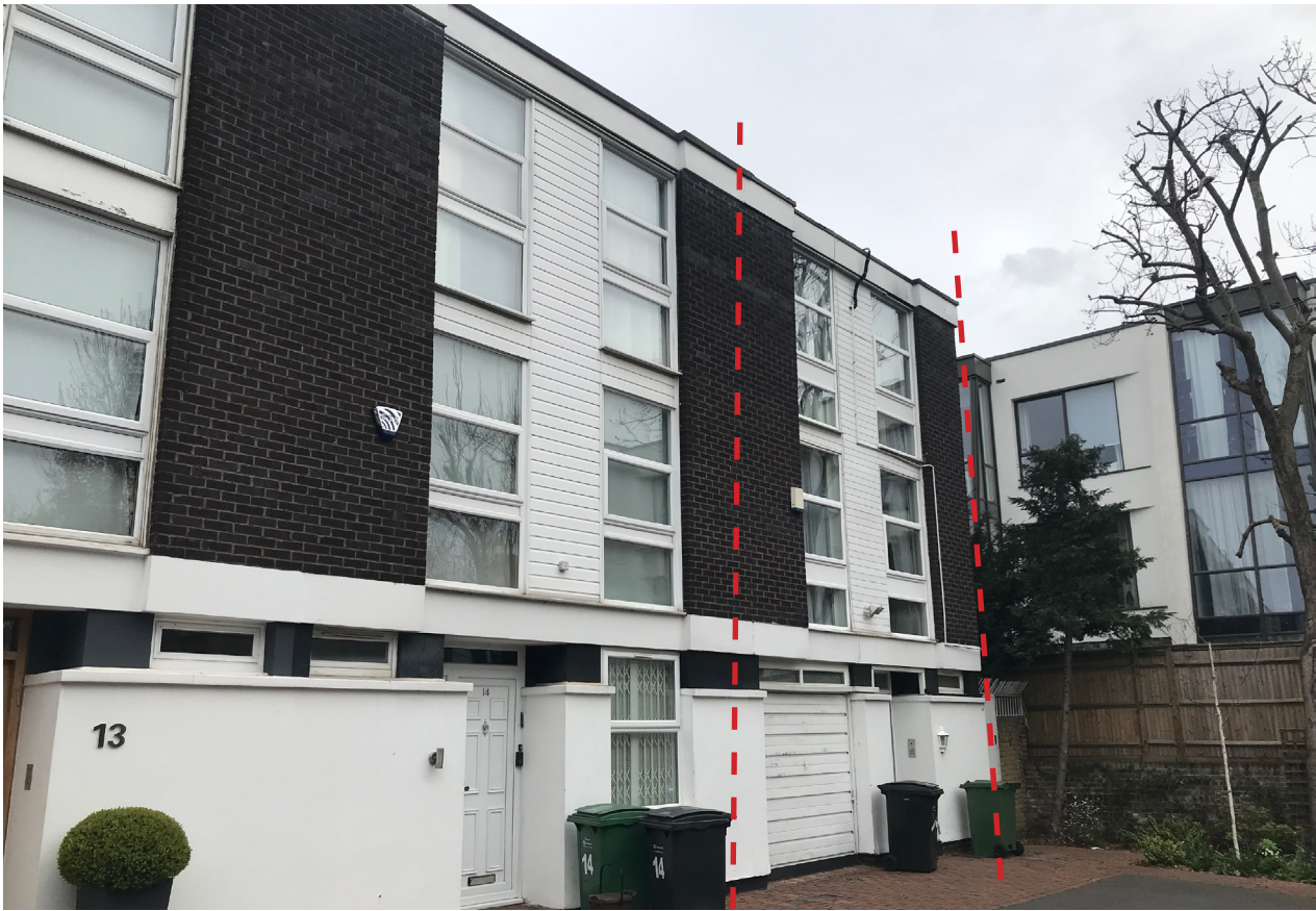
Front of No 15 Elliott Square, seen from the square