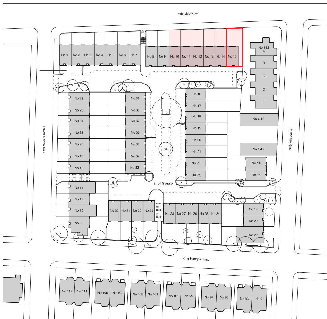
Site Plan of Elliott Square showing No 15

This report describes the existing building and local context, the proposals, the relevant planning policy and planning history, and the pre-application consultation with the local planning authority and local residents.