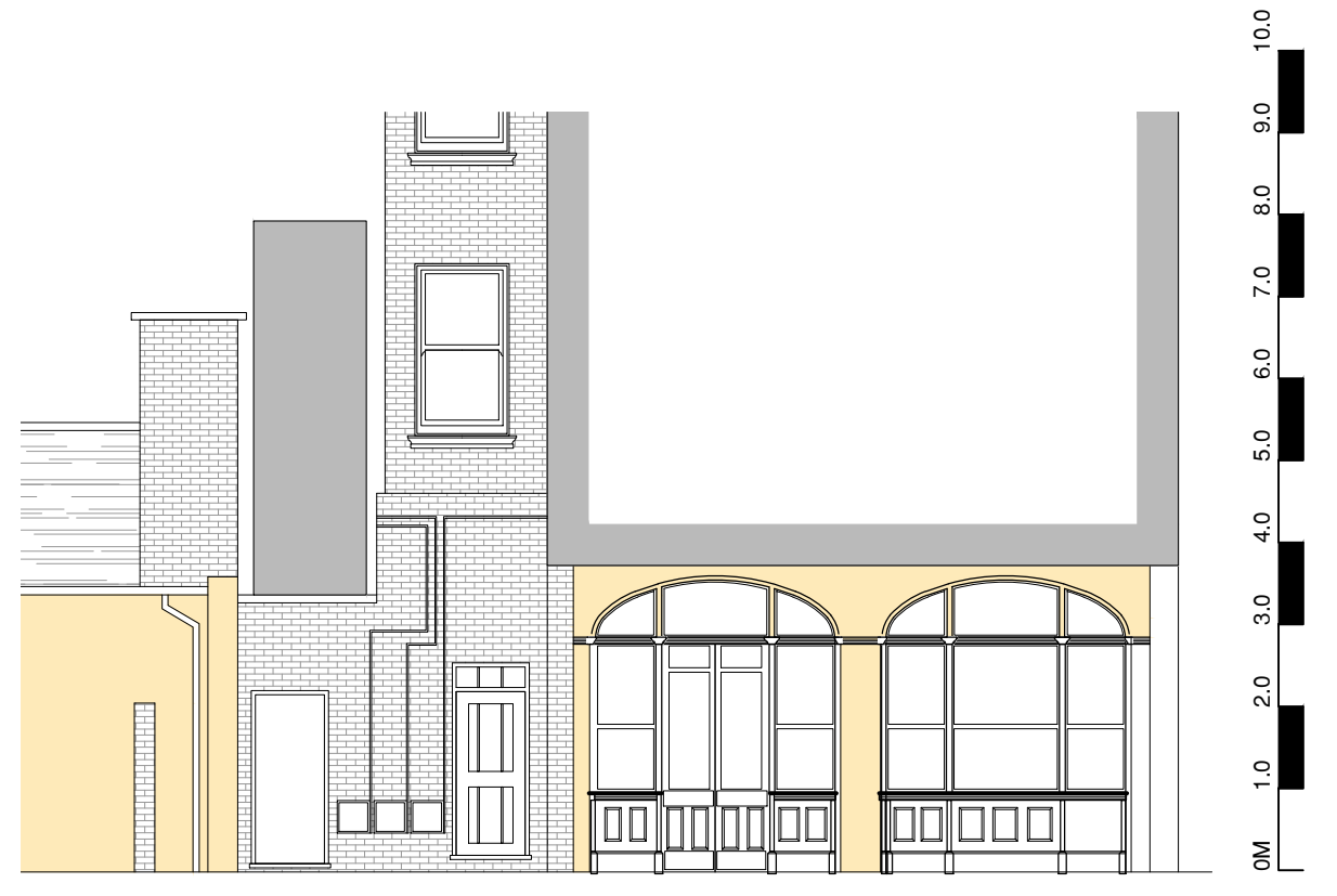
EXISTING SIDE [WEST] ELEVATION - 1:100

THIS DRAWING IS INDICATIVE ONLY AND MUST NOT BE RELIED UPON FOR CONSTRUCTION - UNLESS THE DRAWING IS NAMED AS 'CONSTRUCTION'.