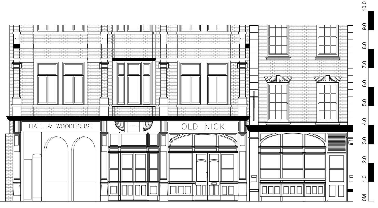
EXISTING FRONT [SOUTH] ELEVATION - 1:100