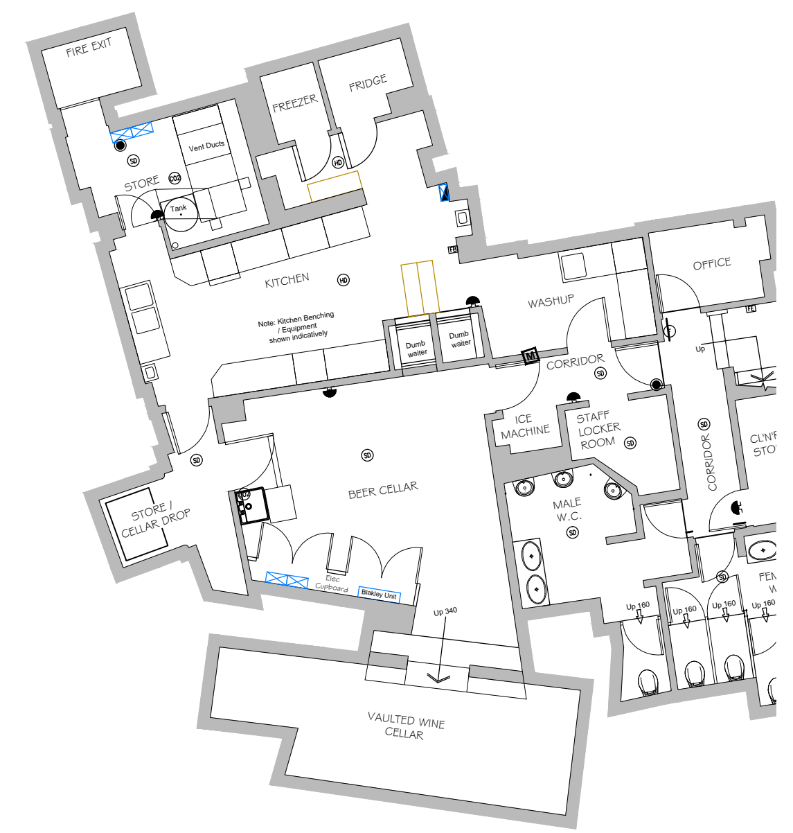
EXISTING BASEMENT / CELLAR FLOOR PLAN - 1:100

THIS DRAWING IS INDICATIVE ONLY AND MUST NOT BE RELIED UPON FOR CONSTRUCTION - UNLESS THE DRAWING IS NAMED AS 'CONSTRUCTION'. ALL DIMENSIONS TO BE CHECKED AND VERIFIED WITH ANY DISCREPANCIES REPORTED TO PHILIPS SURVEYORS LLP. THIS DRAWING REMAINS THE PROPERTY OF PHILIPS SURVEYORS AND MUST NOT BE COPIED OR REPRODUCED WITHOUT PRIOR WRITTEN PERMISSION. THE CLIENT MUST FAMILIARISE THEMSELVES WITH: • THEIR DUTIES CONCERNING HEALTH & SAFETY UNDER CDM 2015 REGULATIONS AND • THE APPOINTMENT OF PRINCIPAL DESIGNER AND PRINCIPAL CONTRACTOR. IF YOU NEED ANY FURTHER INFORMATION OR INDEPENDENT ADVICE ON UNDERTAKING YOUR CDM REGULATIONS DUTIES, PLEASE CONTACT: THE ASSOCIATION FOR PROJECT SAFETY 5 NEW MART PLACE EDINBURGH EH14 1RW TEL: 08456 121 290 EMAIL: INFO@APS.ORG.UK YOU CAN VISIT THE HSE AND APS WEBSITES FOR MUCH MORE INFORMATION AT: WWW.HSE.GOV.UK AND WWW.APS.ORG.UK RESPECTIVELY.