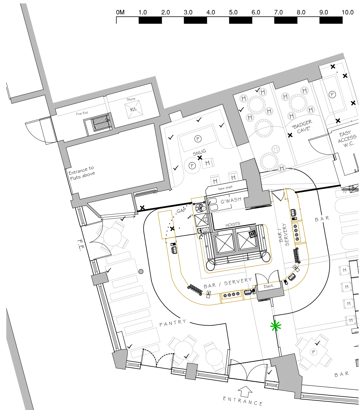
EXISTING GROUND FLOOR PLAN - 1:100