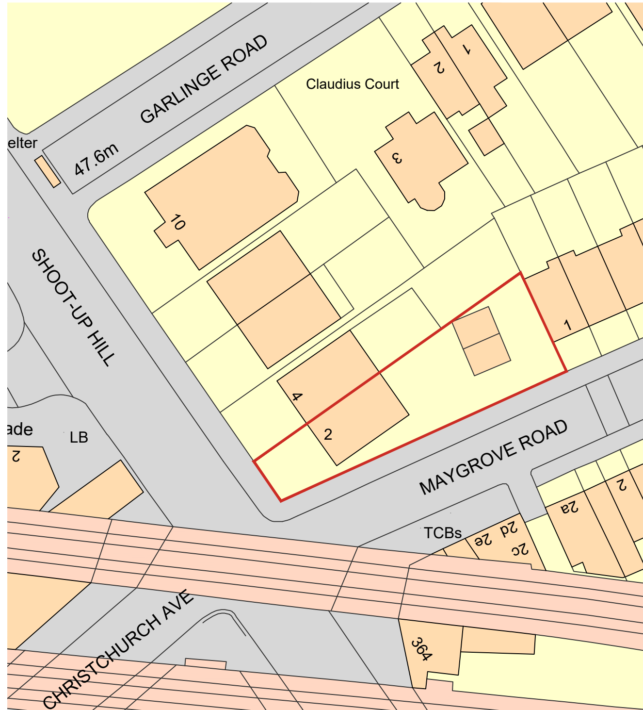
BLOCK PLAN Scale @1:500