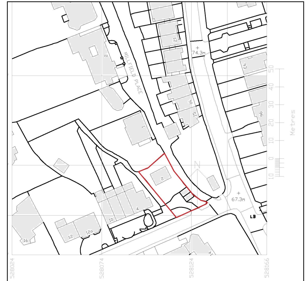
SITE LOCATION PLAN SCALE - 1:1250