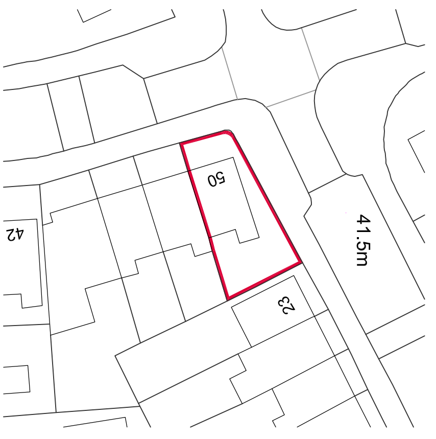
Site Block 1:500