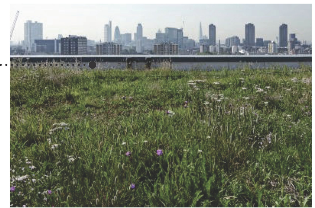
5. GREEN ROOF Intensive Green Roof with deep growing substrate and biodiverse planting of grasses, herbaceous and shrub planting.