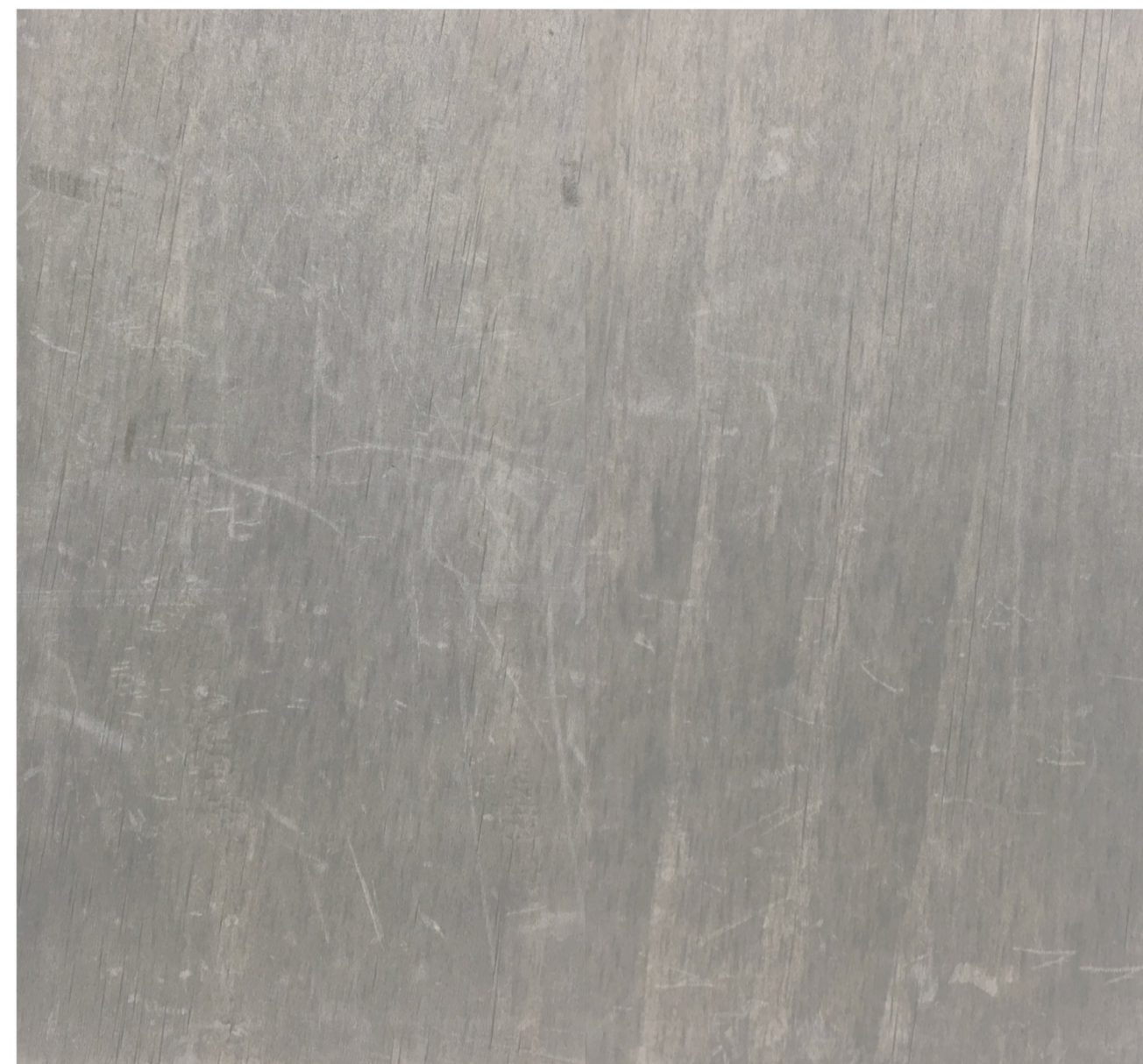
2. TIMBER Accoya or similar modified softwood naturally weathered to silver grey colour