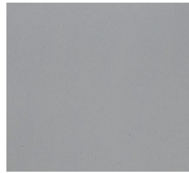
6. WATERPROOFING MEMBRANE Single-ply PVC membrane on roof finish and parapets.