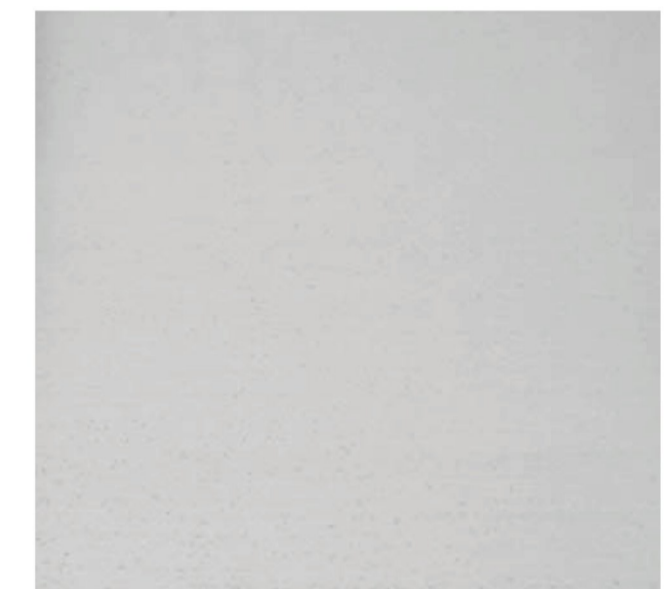
4. STAINLESS STEEL Kick plates, handles and special panels in brushed finish