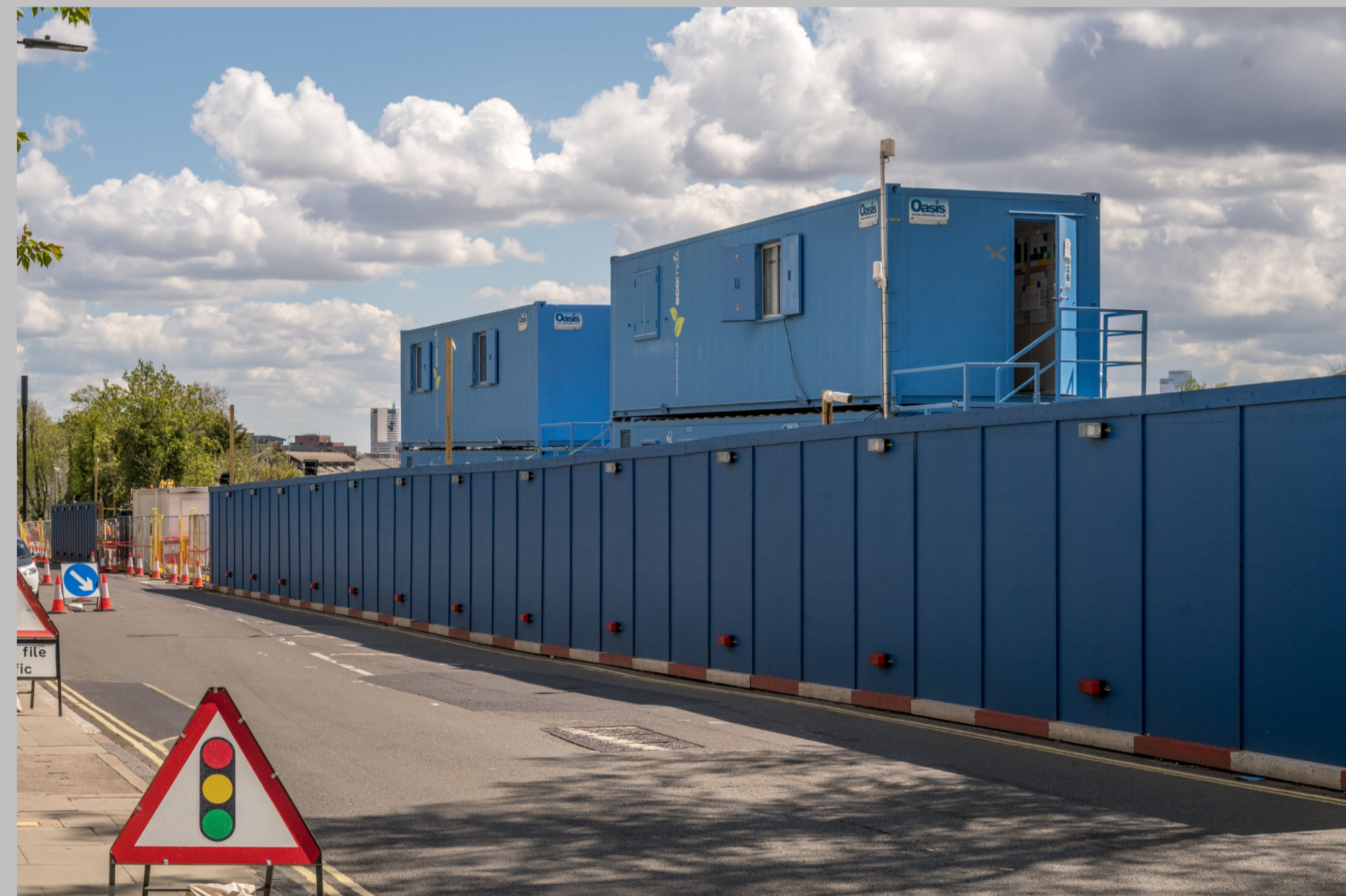
Viewpoint 52 : Year 0 Photography 2021