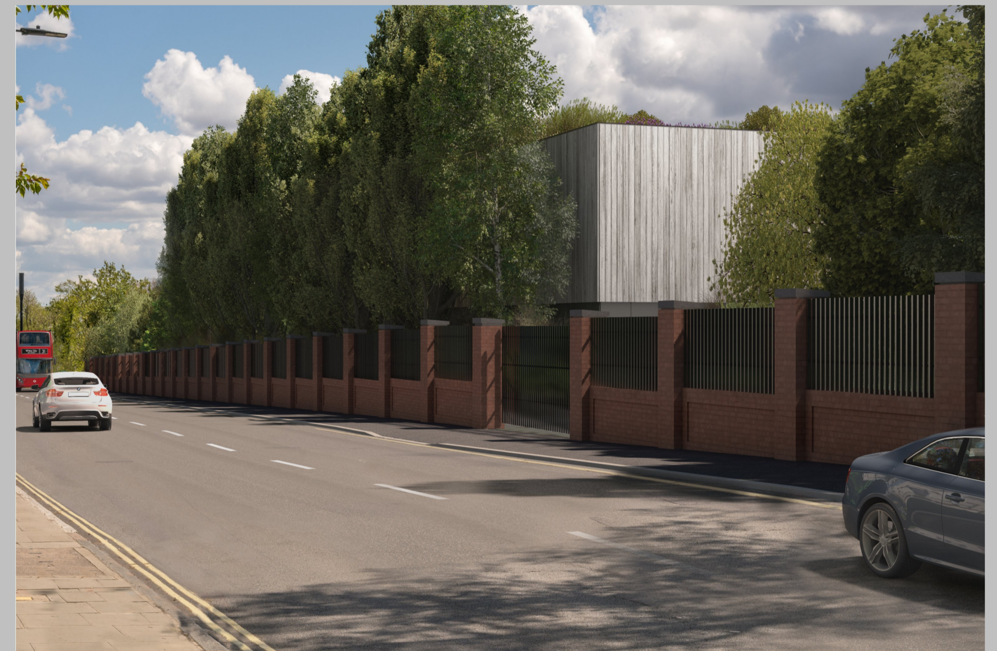
Viewpoint 52 : Operation Year: 15