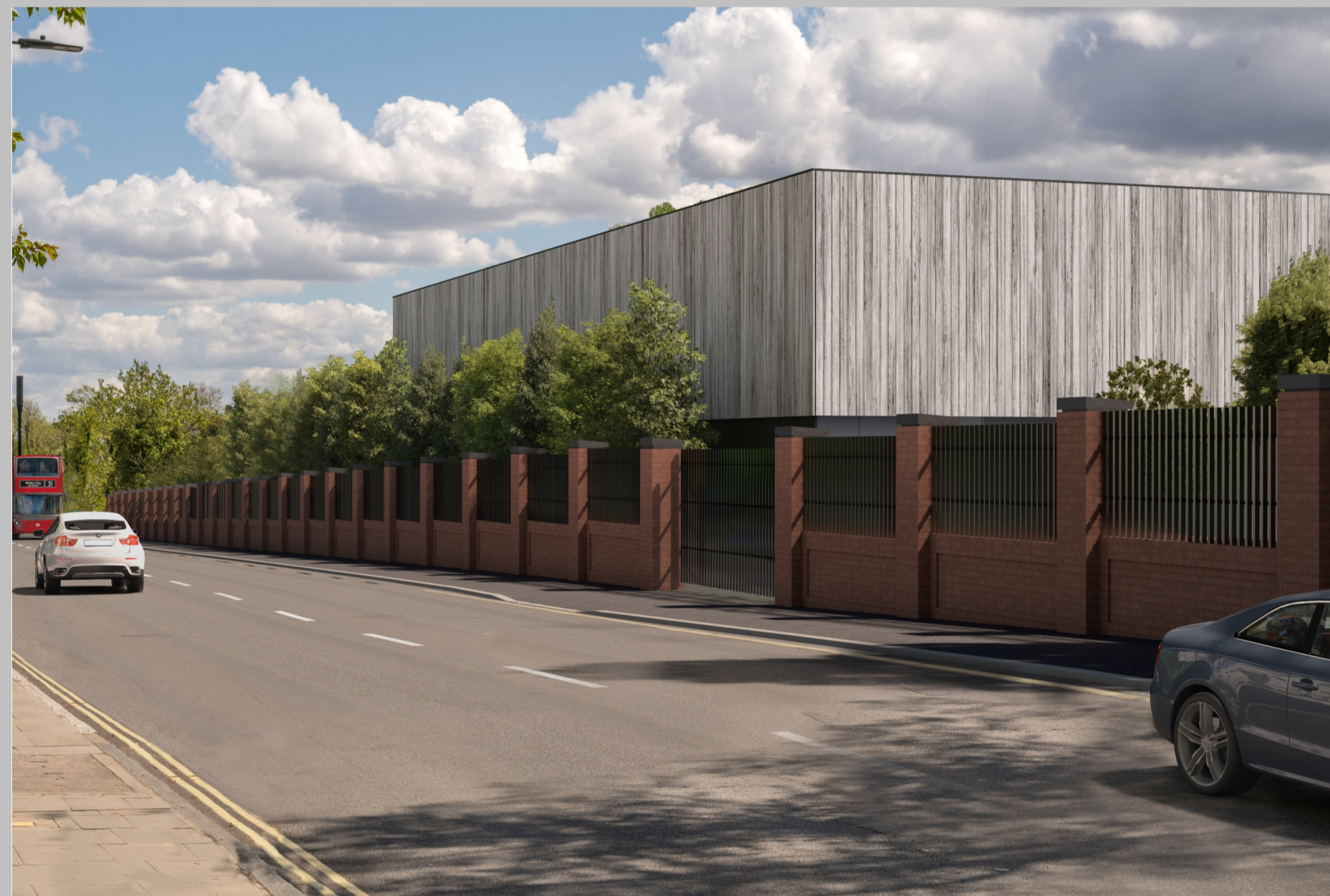
Viewpoint 52 : Operation Year: 1