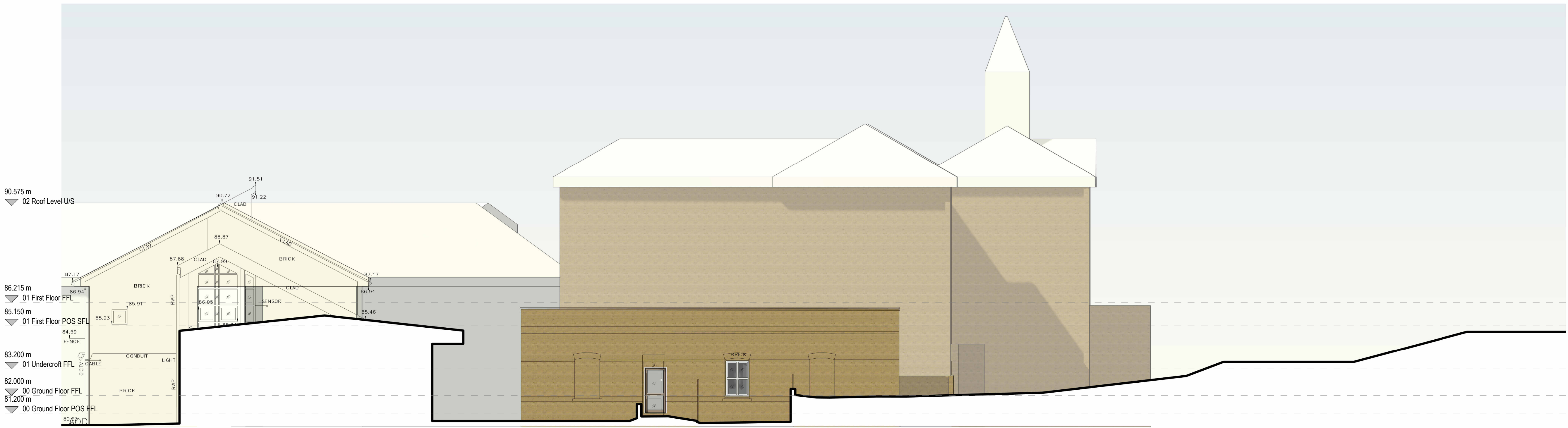
01 Elevation B (East) Existing 1 : 100