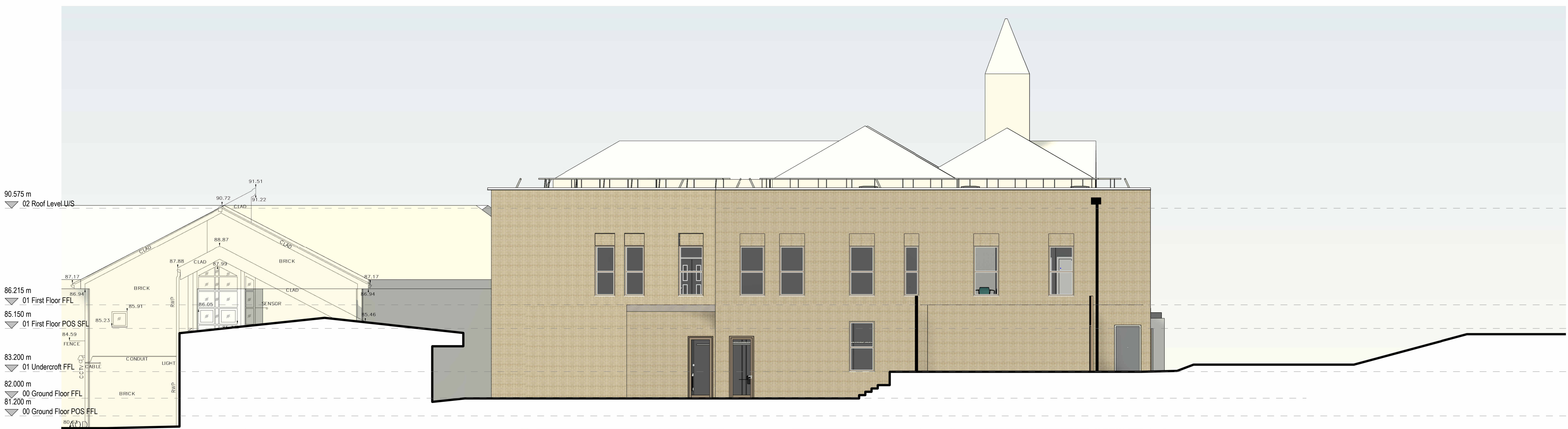
02 Elevation B (East) 1 : 100