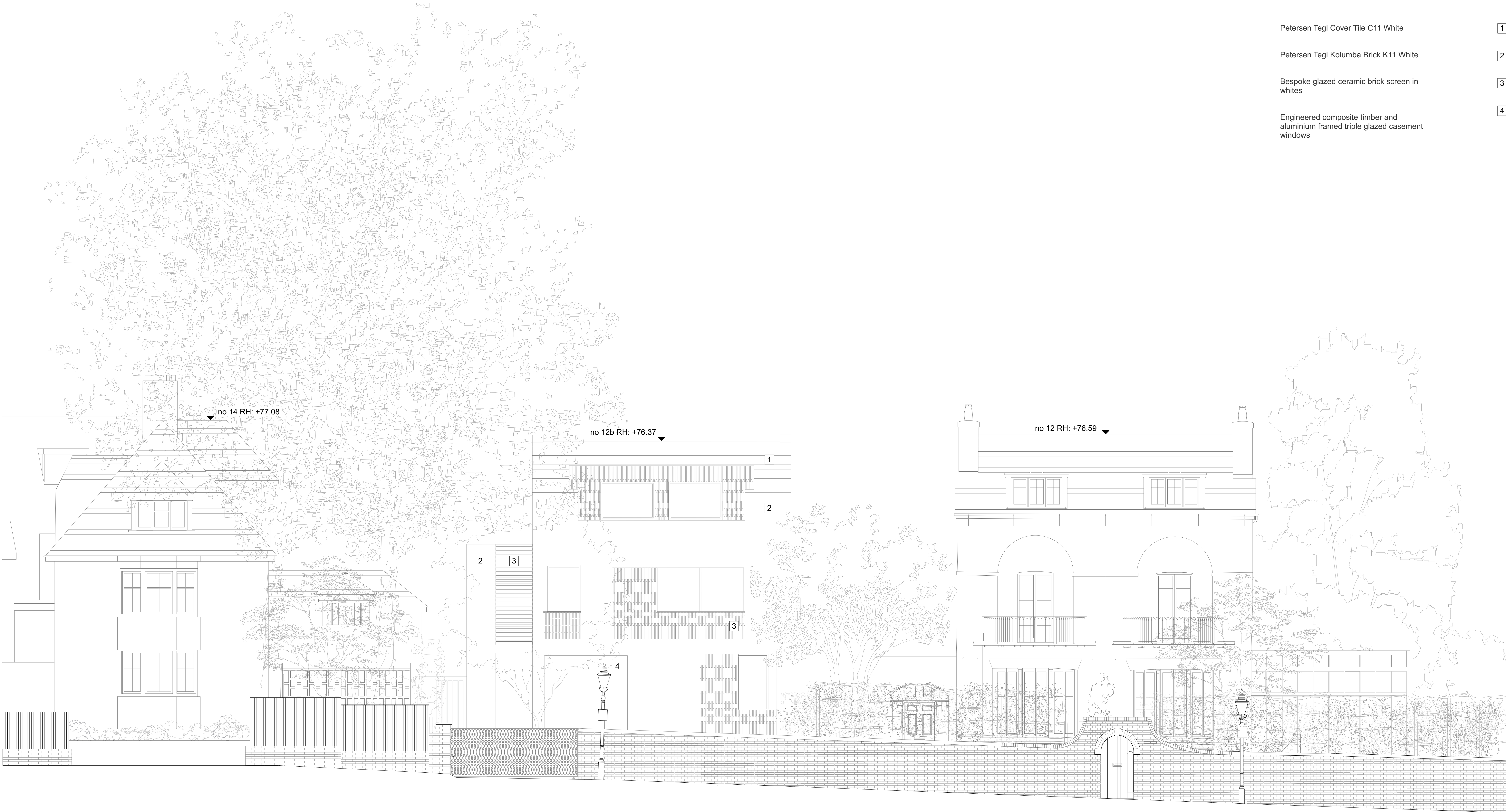
1 Proposed South Elevation Street Context Scale @ A0 1:50 Scale @ A2 1:100