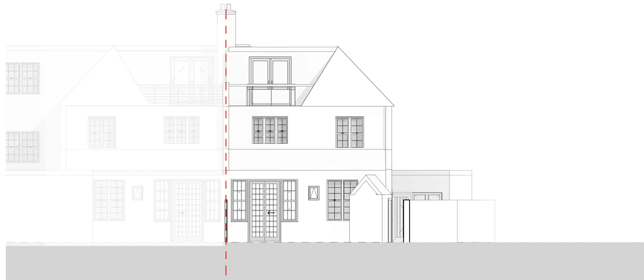
② Proposed Rear Elevation 1 : 100