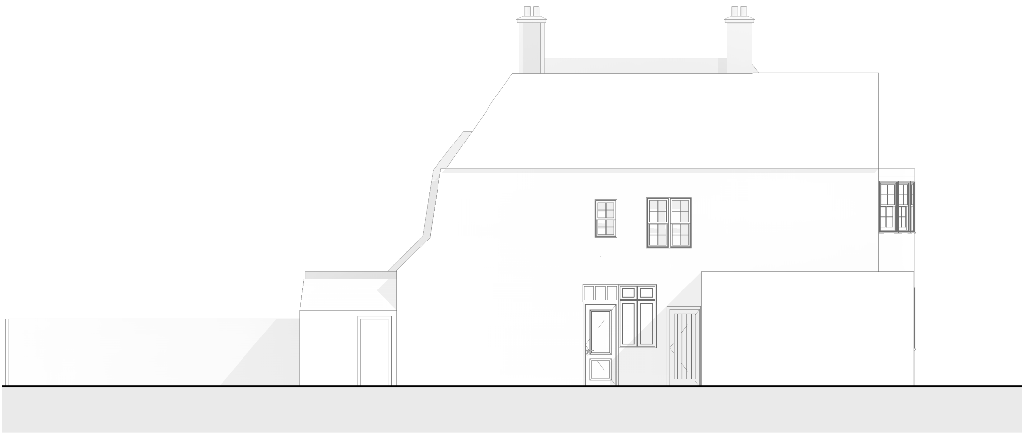
② Existing Side Elevation 1 : 100