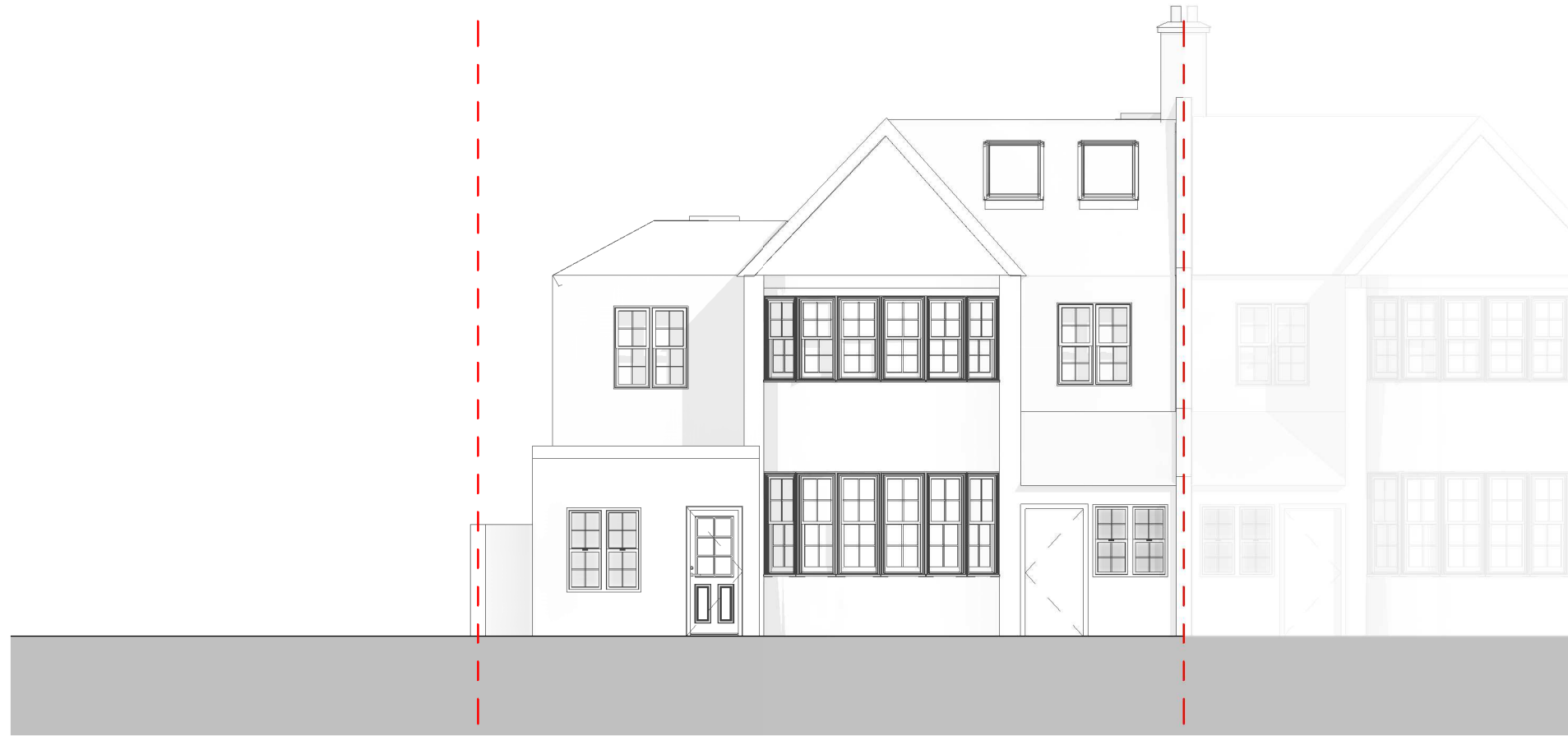
② Proposed West Elevation 1 : 100