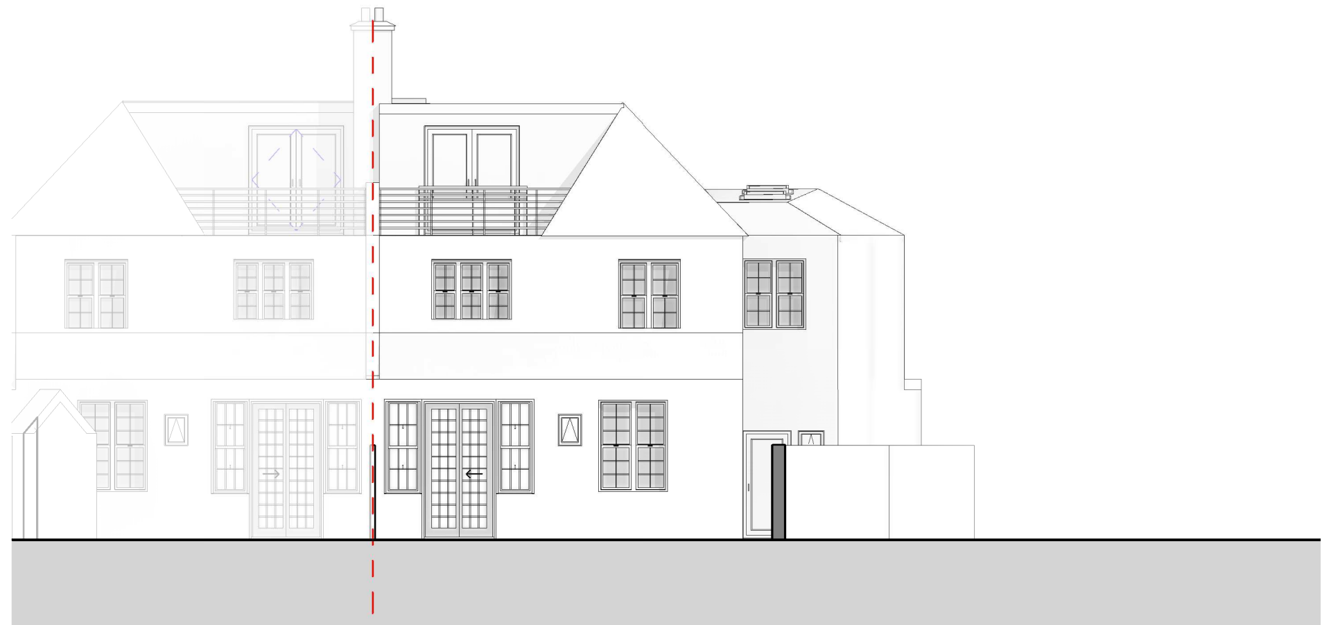
① Proposed East Elevation 1 : 100