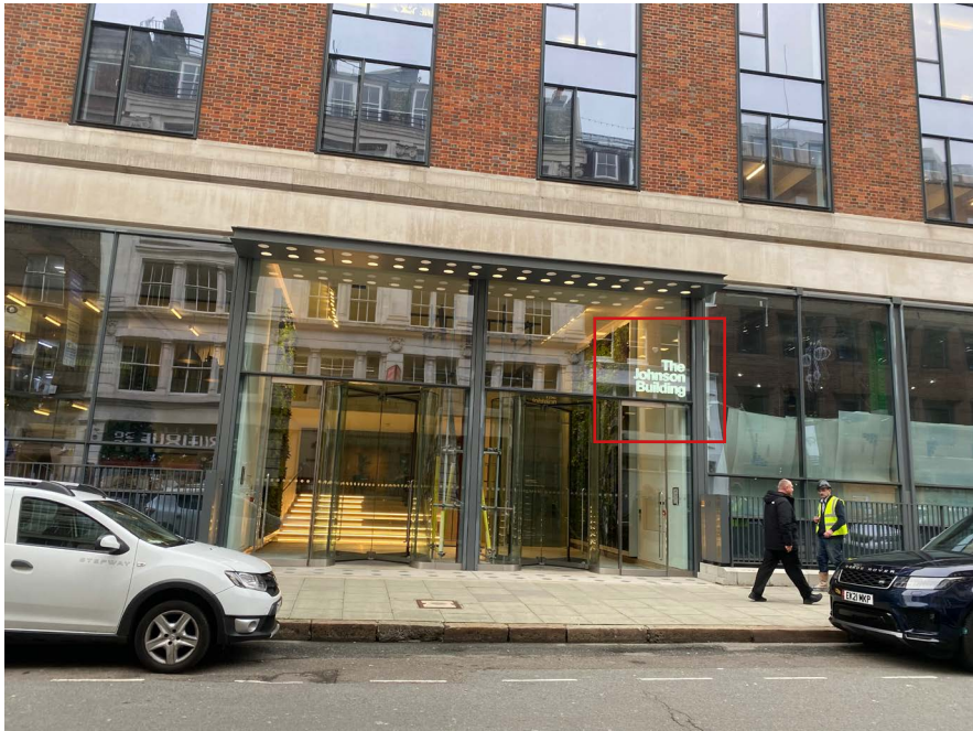
East Elevation - E1 Removal of Building ID