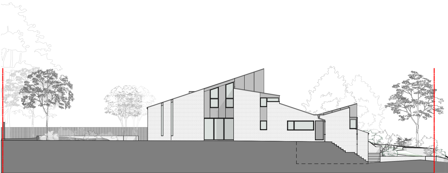
SIDE NORTH-WEST ELEVATION SCALE 1:200