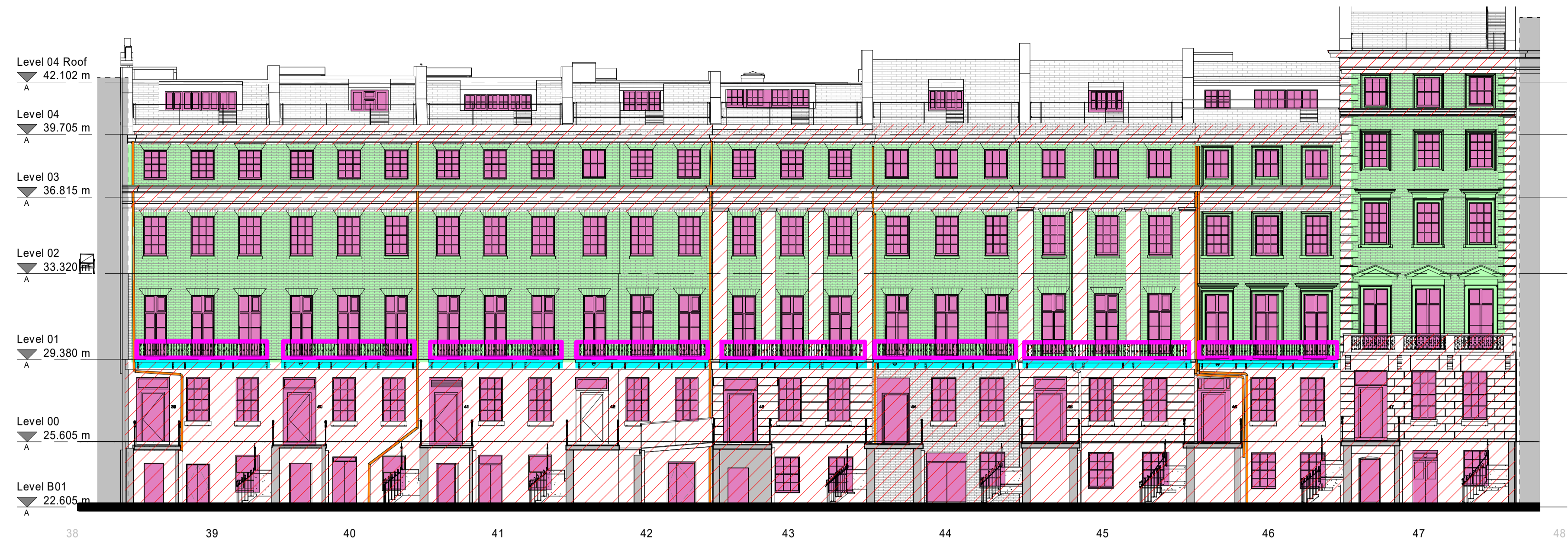
2. Planning - Scope of Works to Front Elevation (South West) 1 : 150