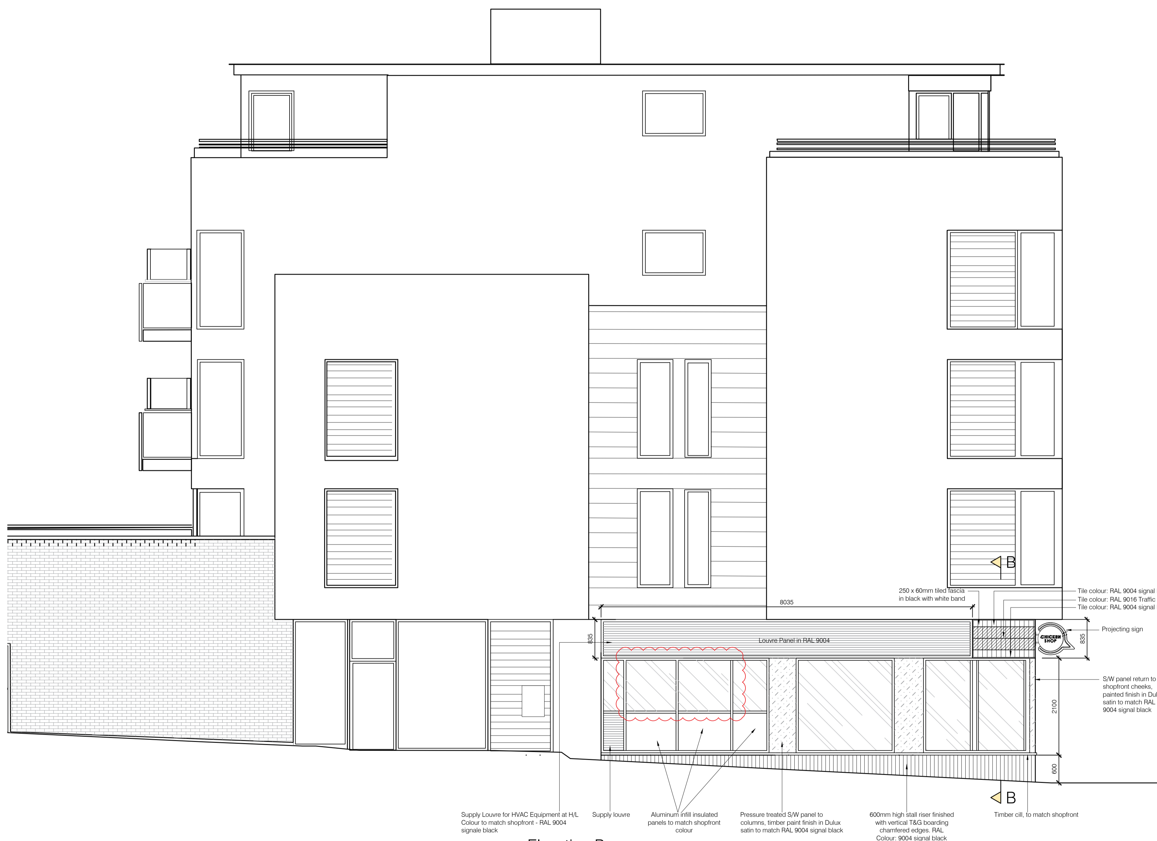
Elevation B Proposed Side Scale 1:50