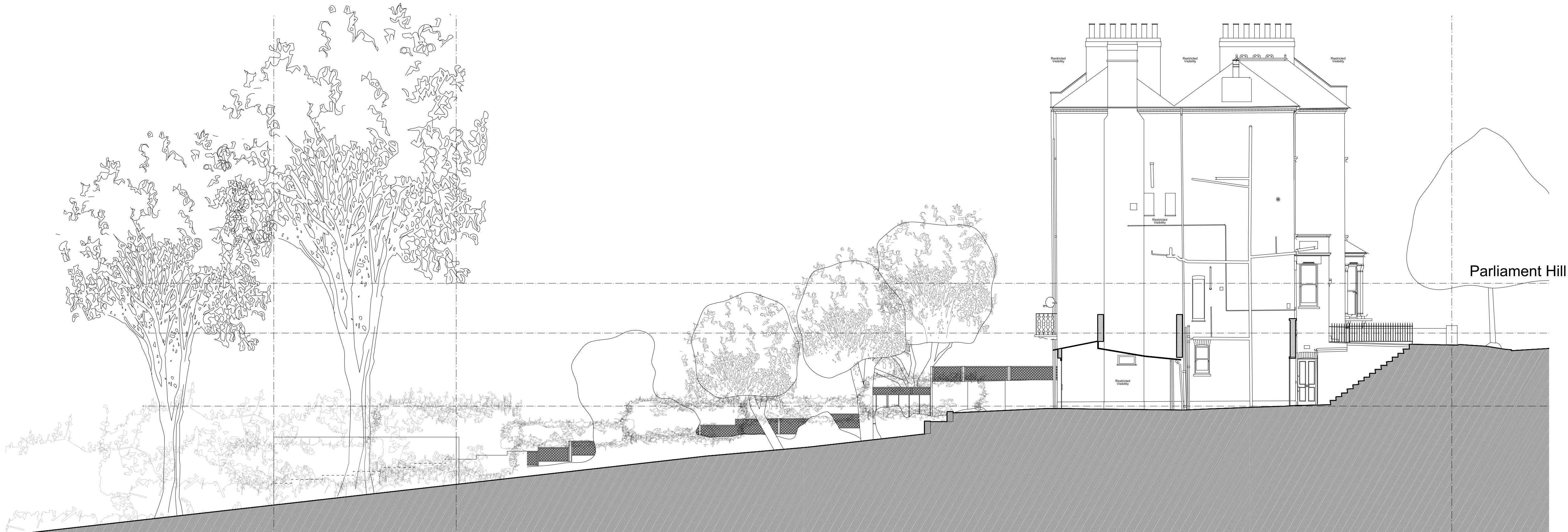
Site Section D-D