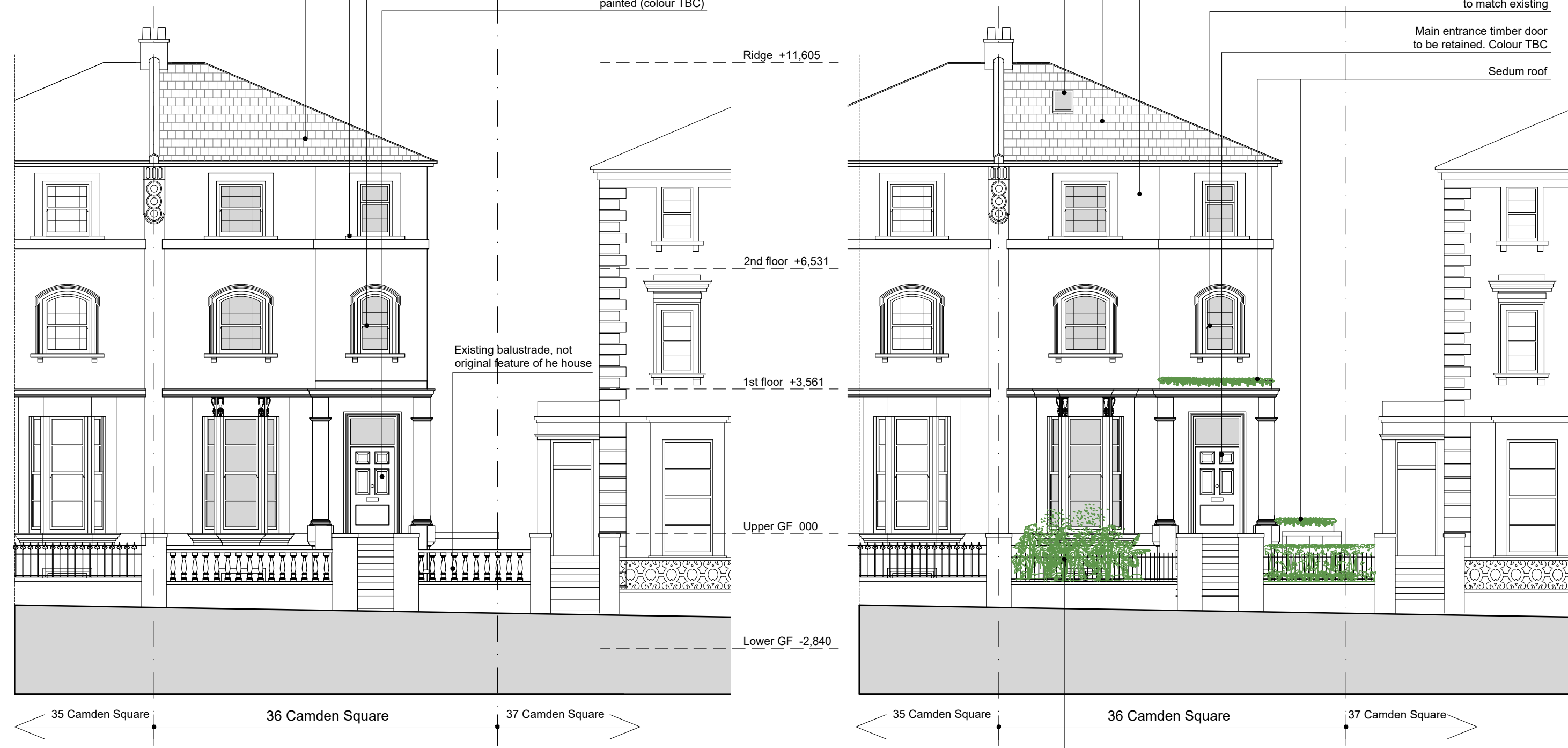
Existing Front Elavation

Main Entrance timber door painted (colour TBC)