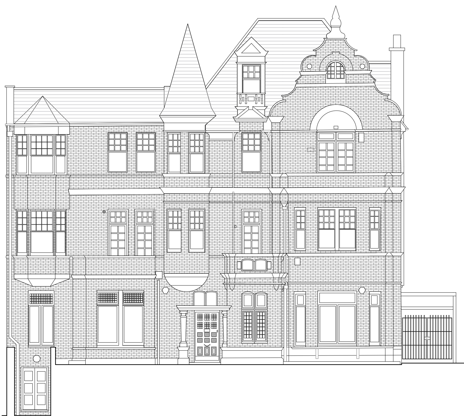
3 Existing North Elevation Scale: 1:100