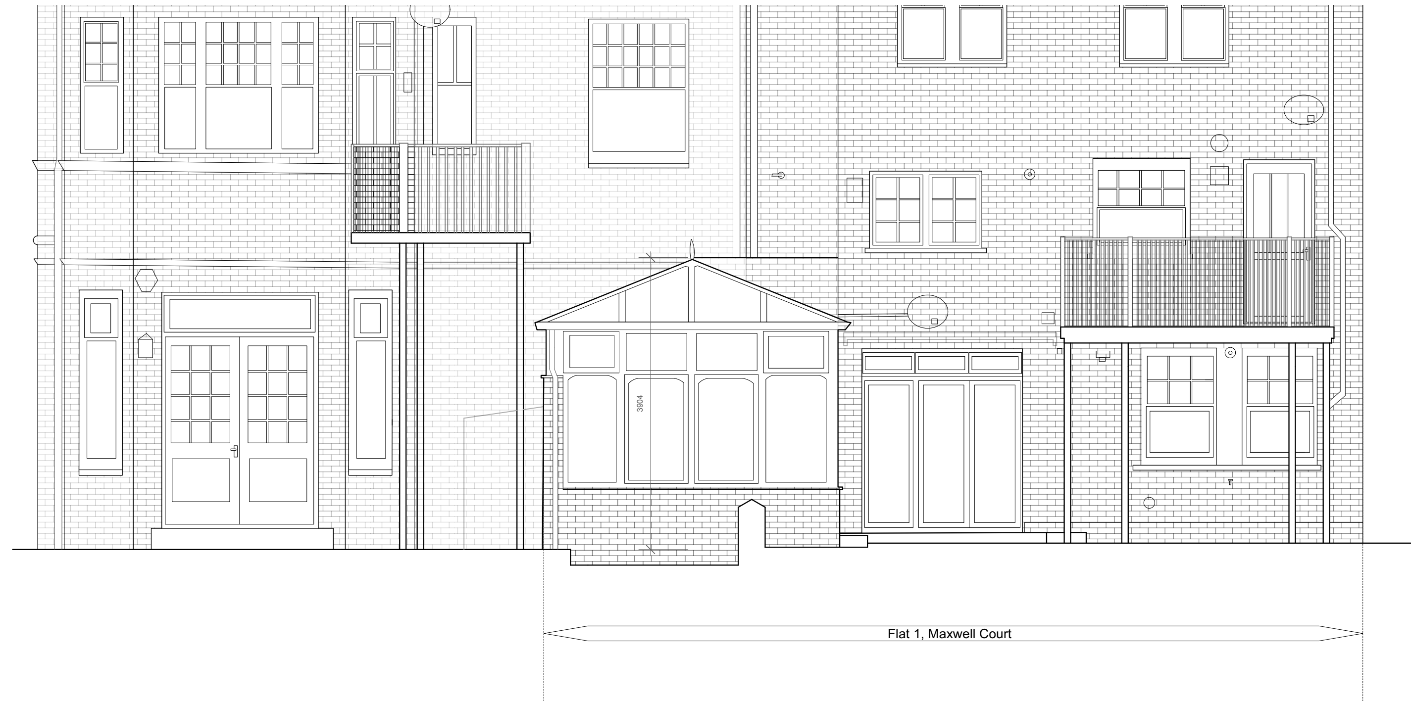
2 Existing South Elevation Detail Scale: 1:50