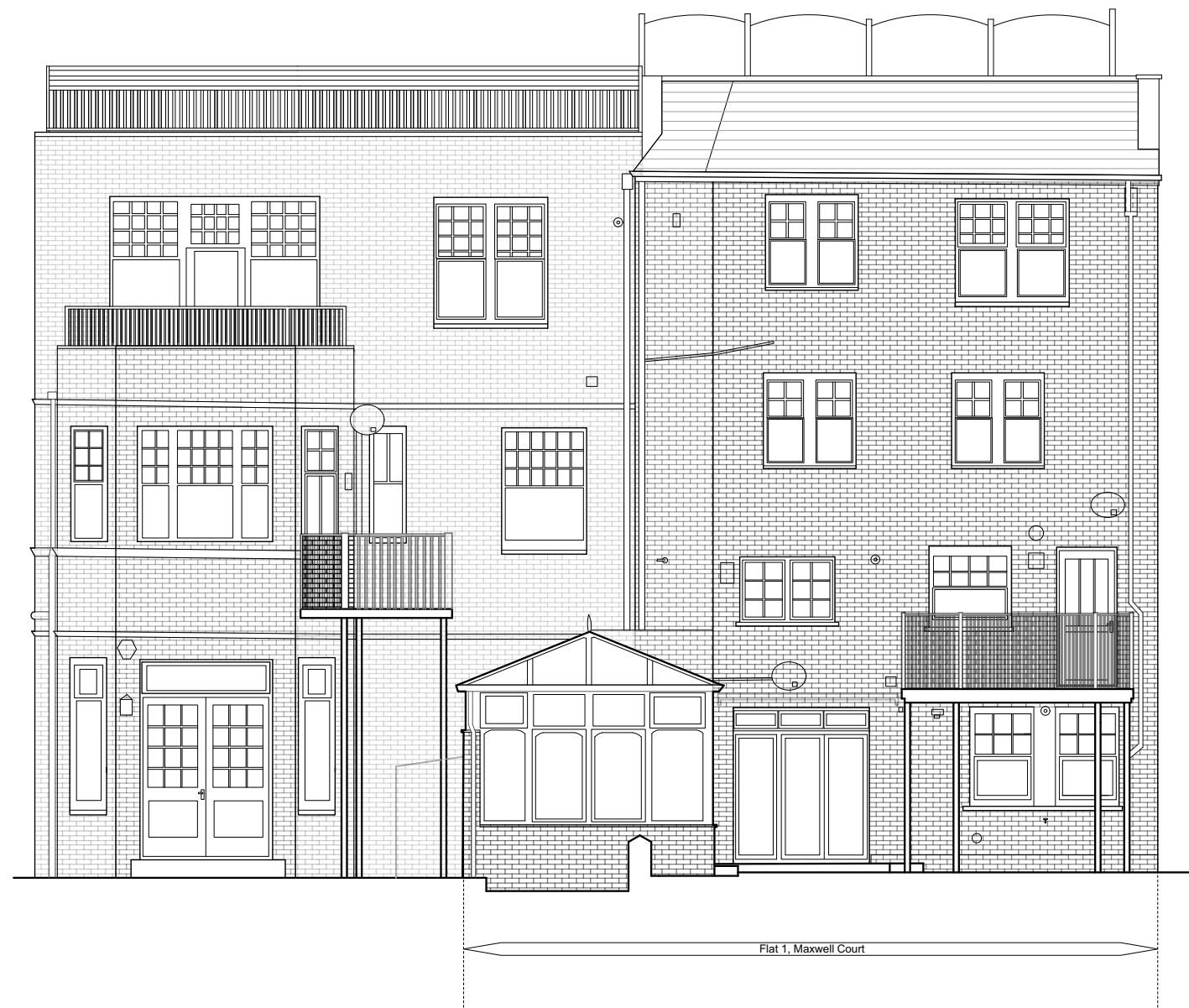
1 Existing South Elevation Scale: 1:100

NOTE: This drawing / document is intended for planning purposes, do not use this as Construction information unless it is issued for Construction. This drawing is copyright by Native North Ltd.