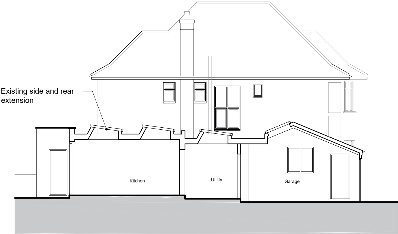
1. EXISTING NORTH ELEVATION