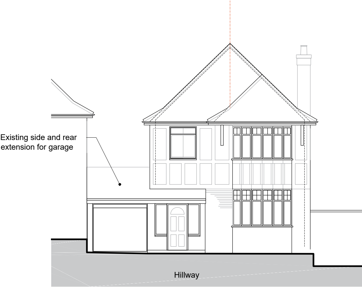
1. EXISTING FRONT ELEVATION