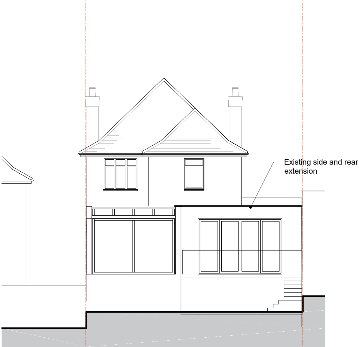
2. EXISTING REAR ELEVATION