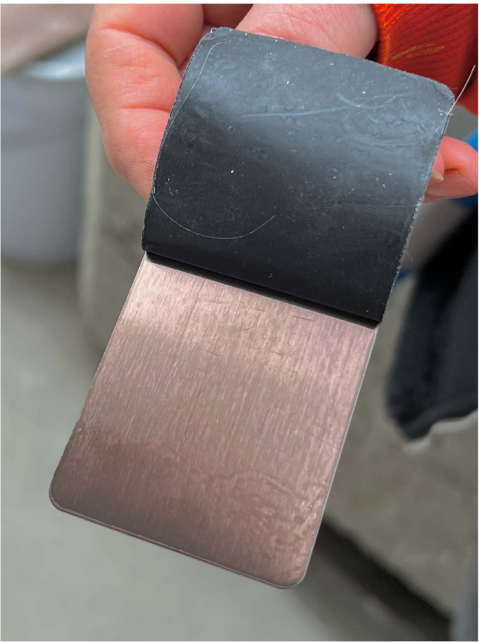
Sample of material

Proposed signage of building Materiality: T22 Quartz bronze Hairline Stainless letterset by Rimex Flat faced, 50mm depth