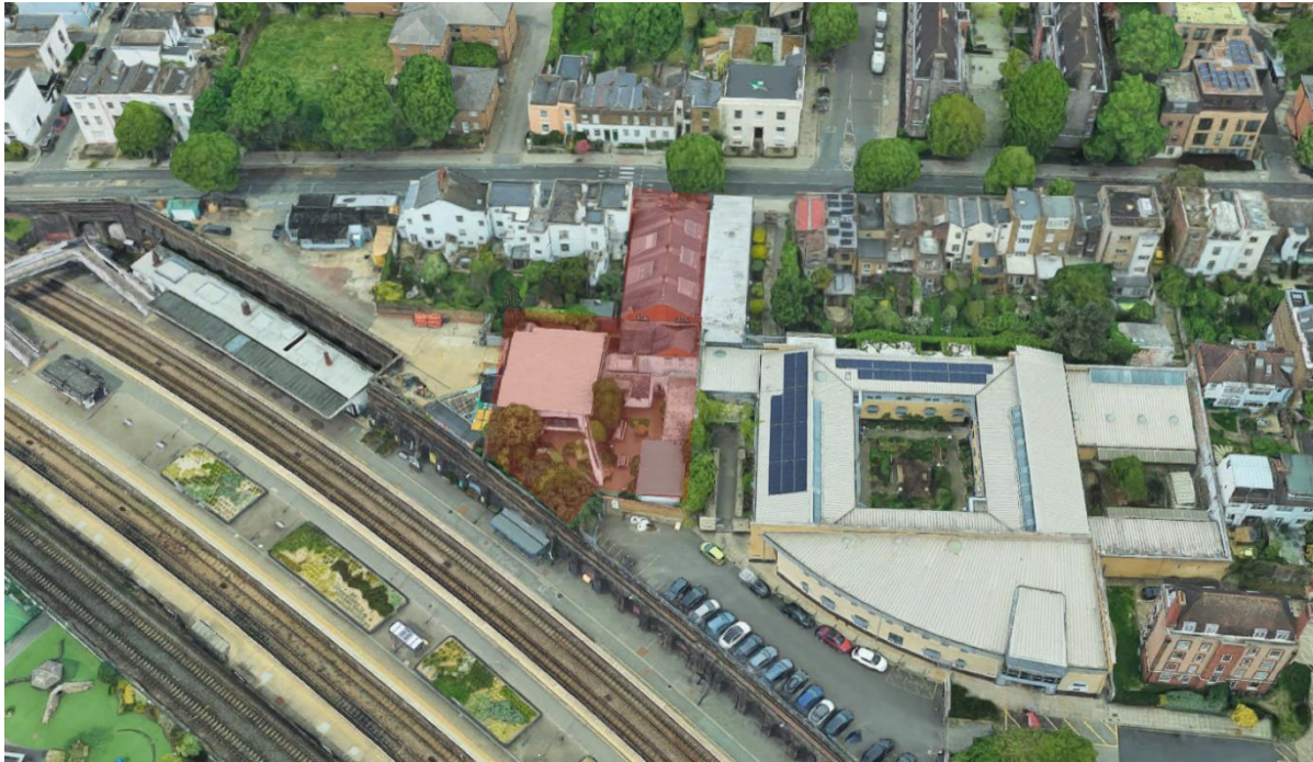
Figure 1. Aerial View of the Application Site

The building fronts onto the southern side of Leighton Road. The frontage includes an off-road area to be used for cycle parking and bin storage, with a small length of historic railings and post box. The application site and surrounding area are depicted in the aerial photograph at Figure 1.