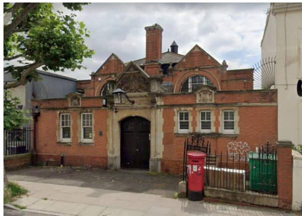
Figure 2. Google Streetview image of the Application Site dated July 2021

In terms of advertisements, there does not seem to have been any signage in place at the site relating to the previous occupiers. Figure 2 below shows the existing historic stonework and lettering to the building frontage.