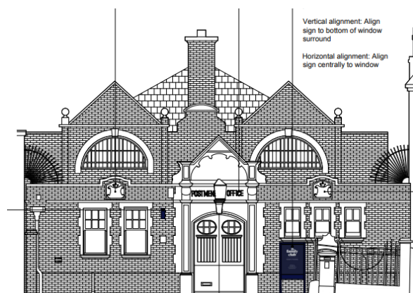
Figure 3. Extract of Proposed Elevation

This application relates to the installation of two external signs to the building frontage. The first being an internally illuminated projecting metal sign, and the second a freestanding non-illuminated metal display board positioned adjacent to the metal boundary railings. An extract of the proposed frontage is included at Figure 3.