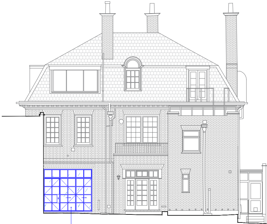
EXISTING EAST ELEVATION (REAR ELEVATION)