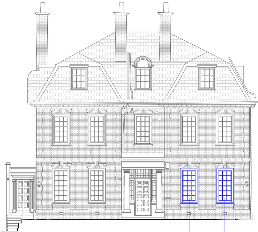
EXISTING WEST ELEVATION (PRINCIPLE ELEVATION)