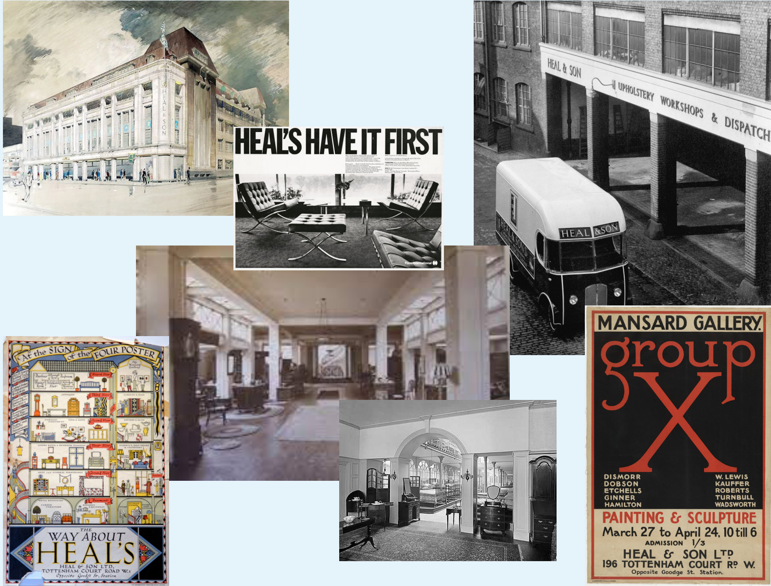
A PIECE OF HISTORY

Turley Planning and Heritage have been appointed as specialists to join the design team for this project; based in part on their previous experience working on this particular listed building, and also their extensive experience managing change for heritage buildings and areas within the London Borough of Camden. The first step for their team has been to undertake targeted research and also on-site surveys and analysis in order to better understand the historical development of this complex, as well as its distinctive architectural character as a multi-phase collection of different built elements. This is the basis upon which the Statement of Heritage Significance has been prepared, which will be used actively to further inform and also guide the design process for the optimisation of the use and sensitive adaptation of this listed building.