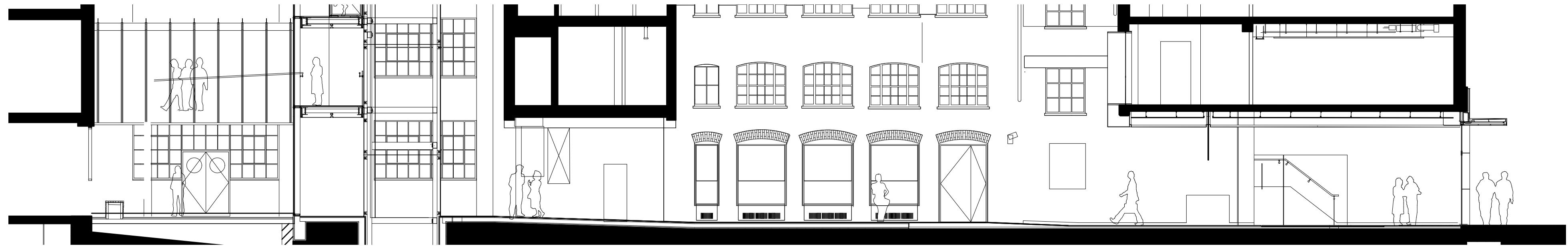
BB West Internal Elevation Scale: 1:100