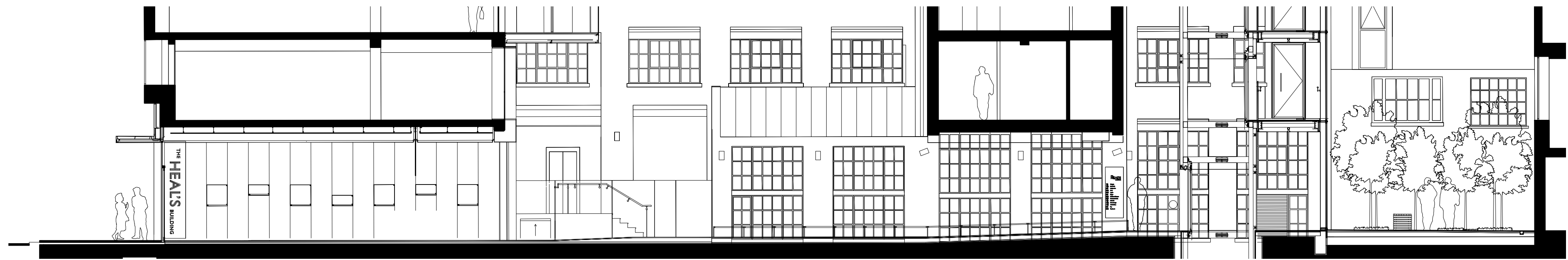
AA East Internal Elevation Scale: 1:100