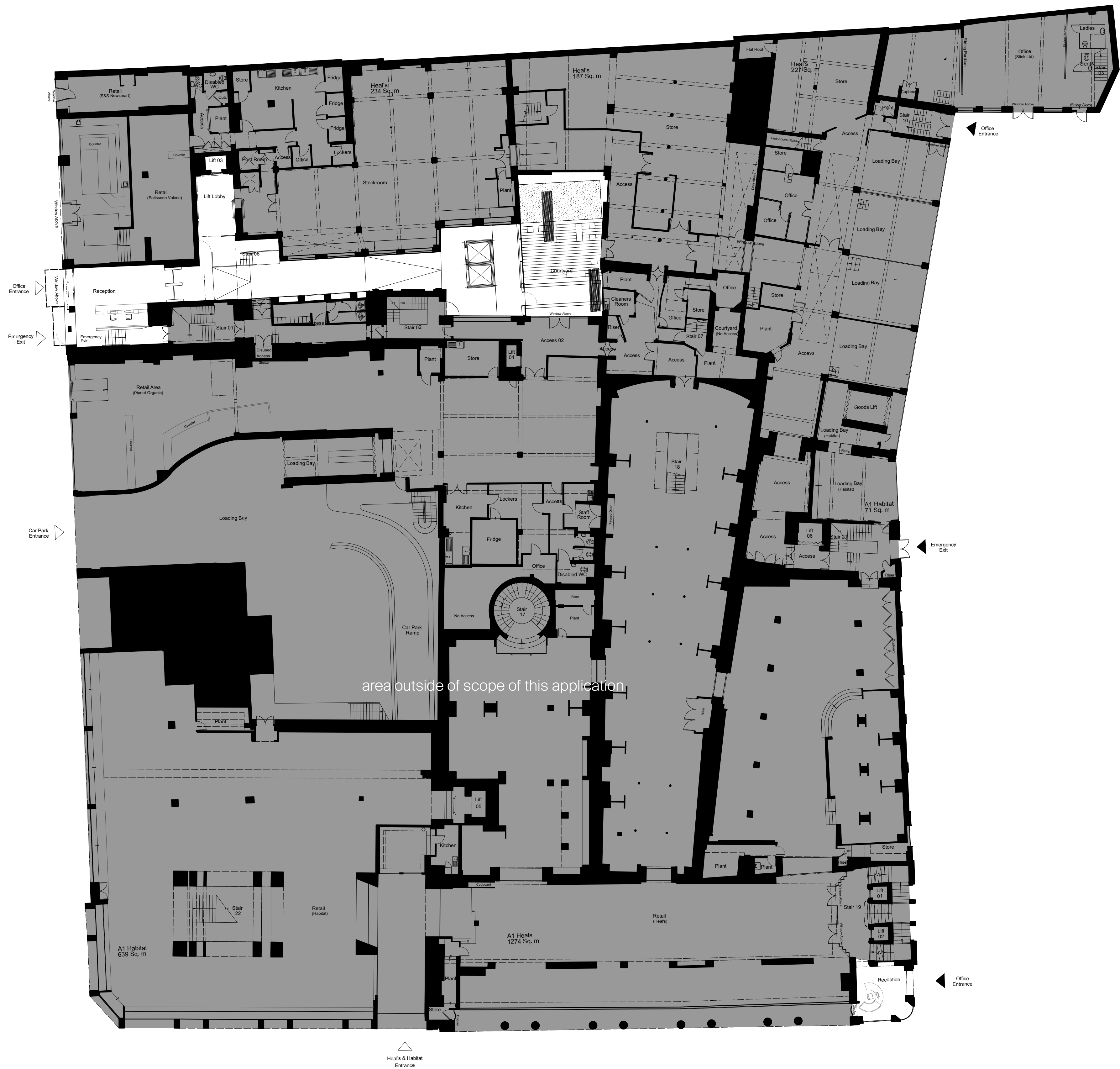
1 Existing - Ground Floor Scale: 1:200