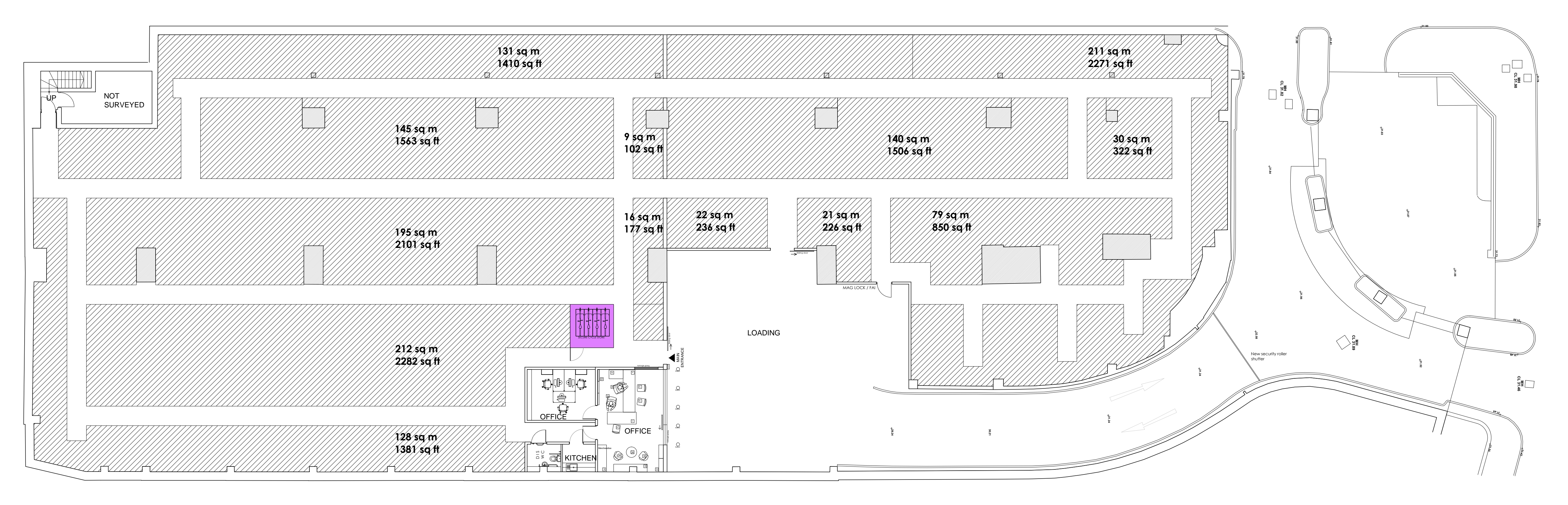
GROSS FLOOR AREA (whitout ramp)- 22 658 sq ft TOTAL NLA- 13 535 sq ft