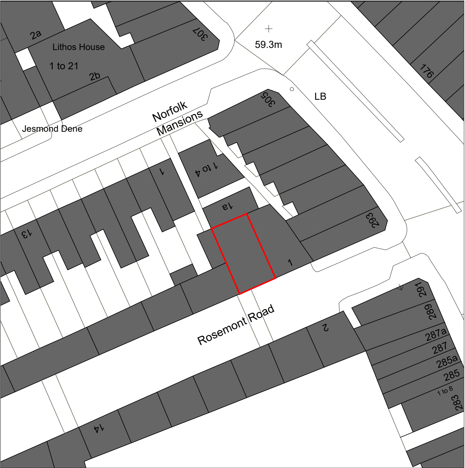
Plan 1 Existing Block Plan Scale 1:500@A3