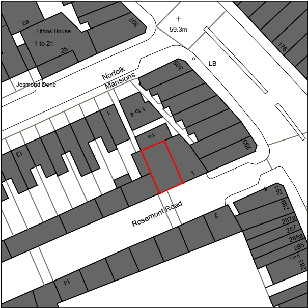
Plan 1 Existing Site Location Plan Scale 1:1250@A3

This drawing is copyright of Ashton Architecture. Do not scale from this drawing. All dimensions and levels to be checked on site by the contractor and such dimensions to be his responsibility. Report all drawing errors, omissions and discrepancies to the architect. DISCLAIMER This document may be issued in an editable digital CAD format to enable others to use it as background information to make alterations and/or additions. In that instance the file will be accompanied by a PDF version as a record of the original file. It is for those parties making such alterations and/or additions to ensure that they make use of current background information. Ashton Architecture accepts no liability for either: any such alterations and/or additions to the background information by others; or any other changes made by others to the architectural content of the background information itself.