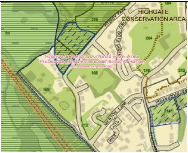
Map 1 (above): Highgate Neighbourhood Plan Areaprivate open spaces are shaded in light green