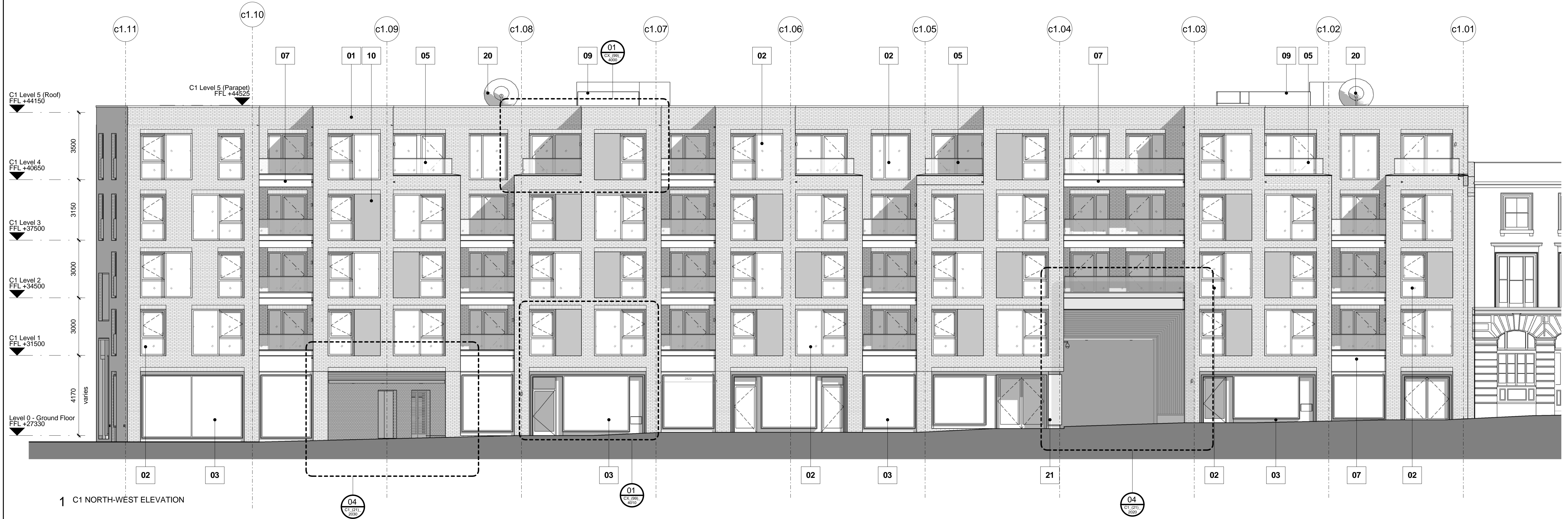
1 C1 NORTH-WEST ELEVATION

This drawing is the last revision issued for construction under the building contract dated July 2016. This drawing has not been verified by site survey and construction tolerances may have resulted in differences between this drawing and the finished building.