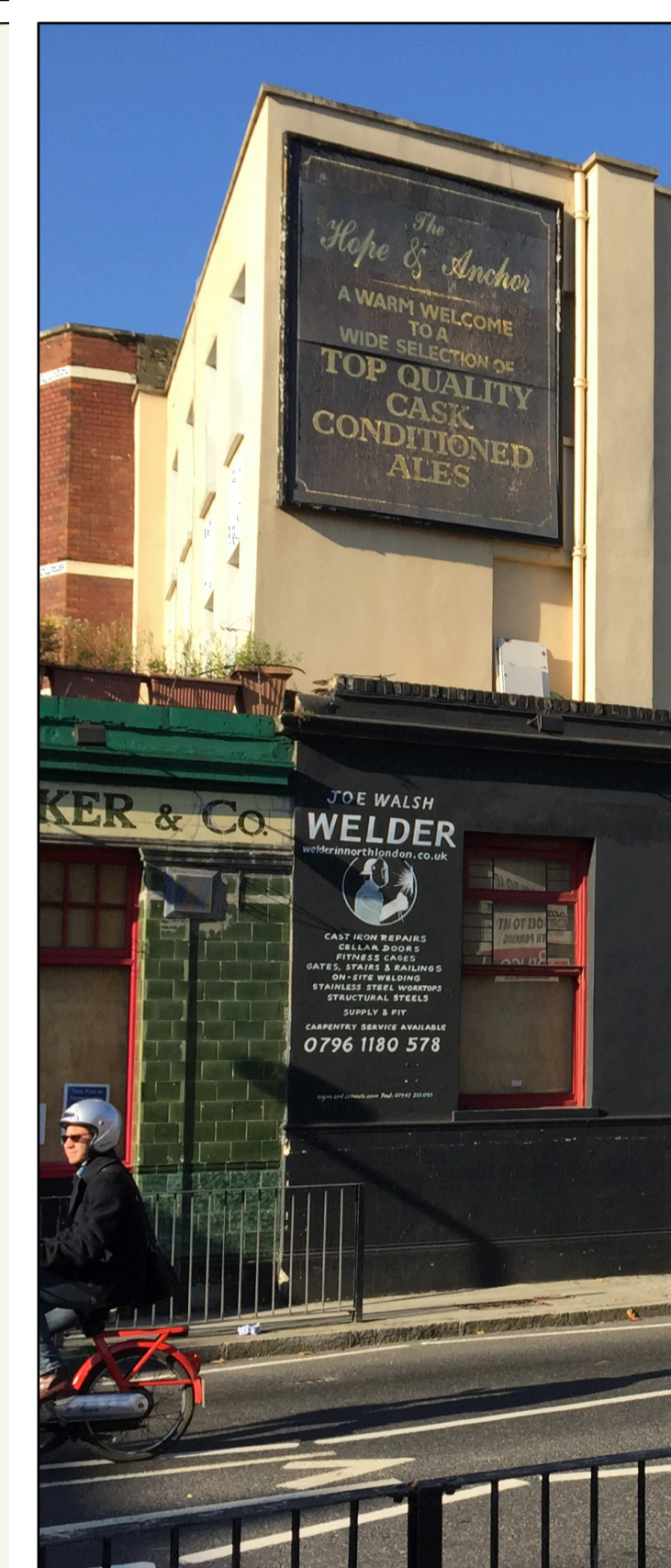
Sign 8 in its original state on Bayham Street