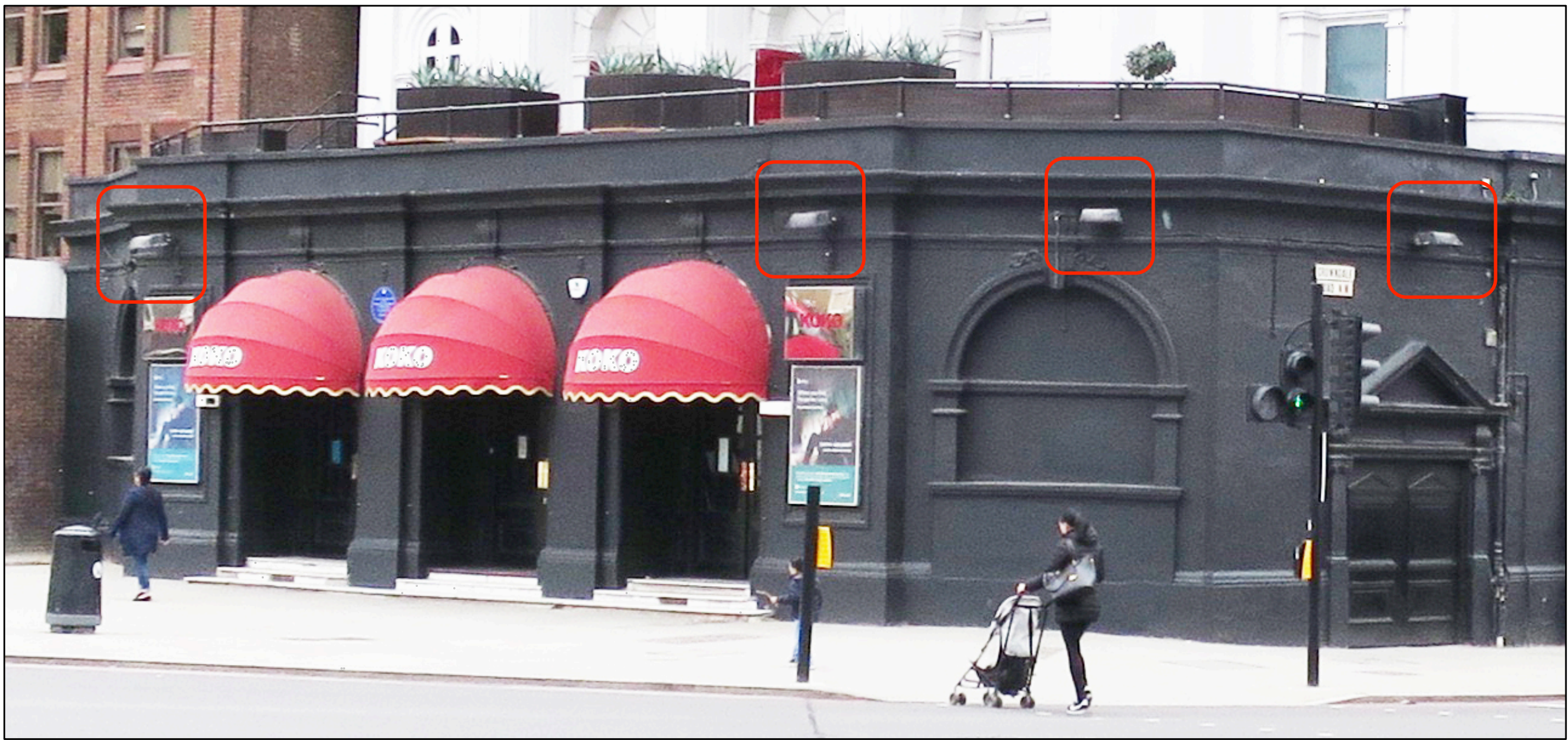
PHOTOGRAPH OF KOKO FRONT FACADE AND CROWDALE ROAD SHOWING EXISTING FLOOD LIGHTING FIXTURES (2016). THESE FLOOD LIGHTS WERE REMOVED DURING CONSTRUCTION WORKS AND ARE TO BE RE-INSTATED IN THEIR ORIGINAL LOCATION.