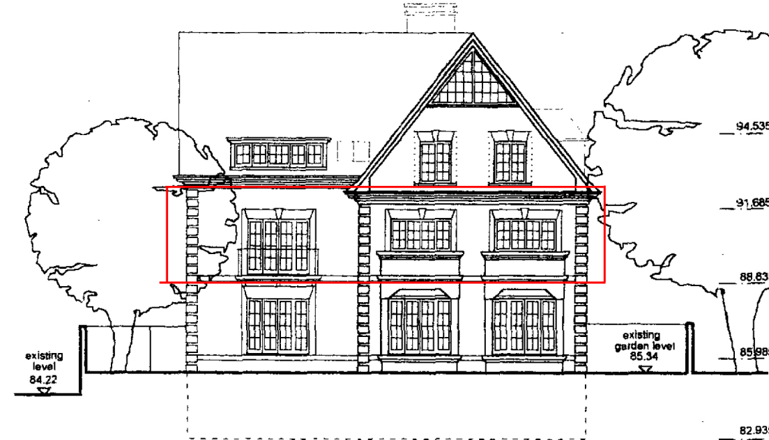
02 - Rear Garden Elevation