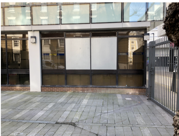
Site of proposed alteration