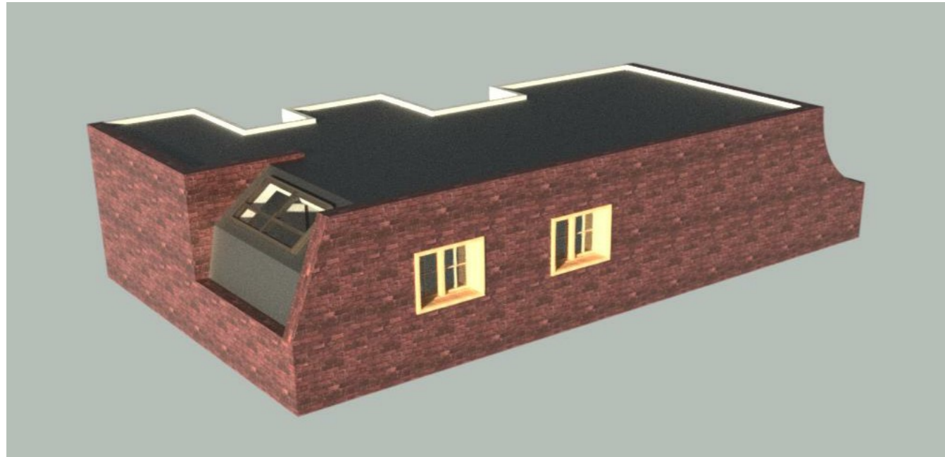
2 3D View 3D View proposed Roof Window 1 : 1