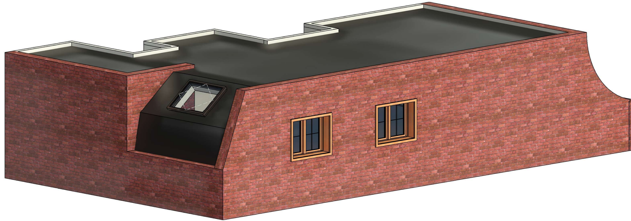
3 3D View Proposed Roof Window