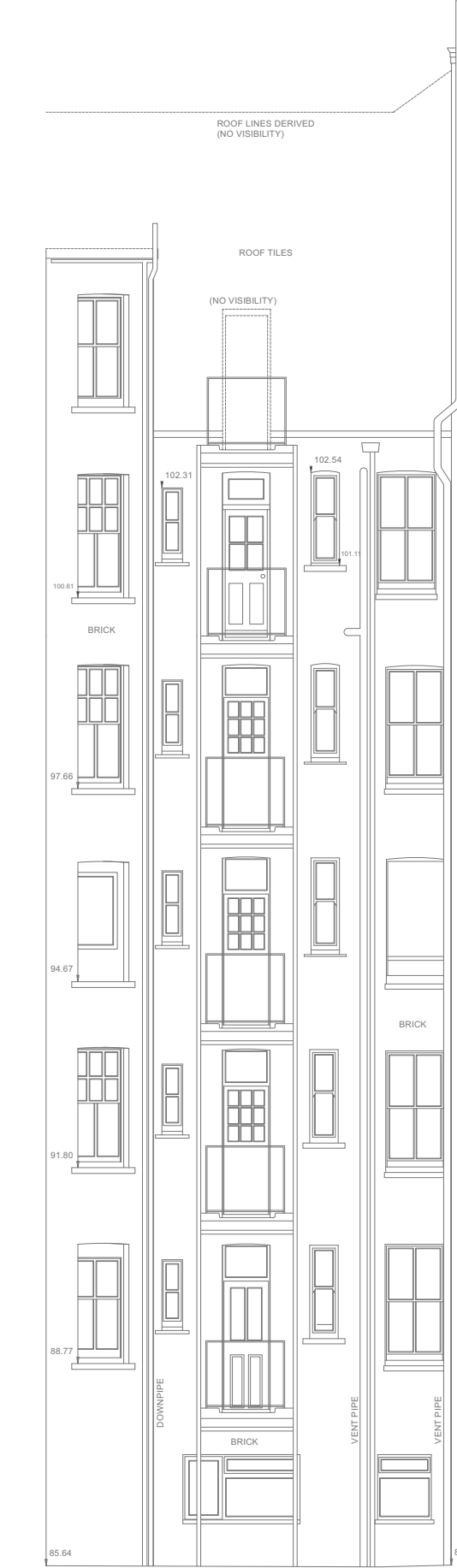
3 Existing South-West Lightwell Elevation 1:100 @A1