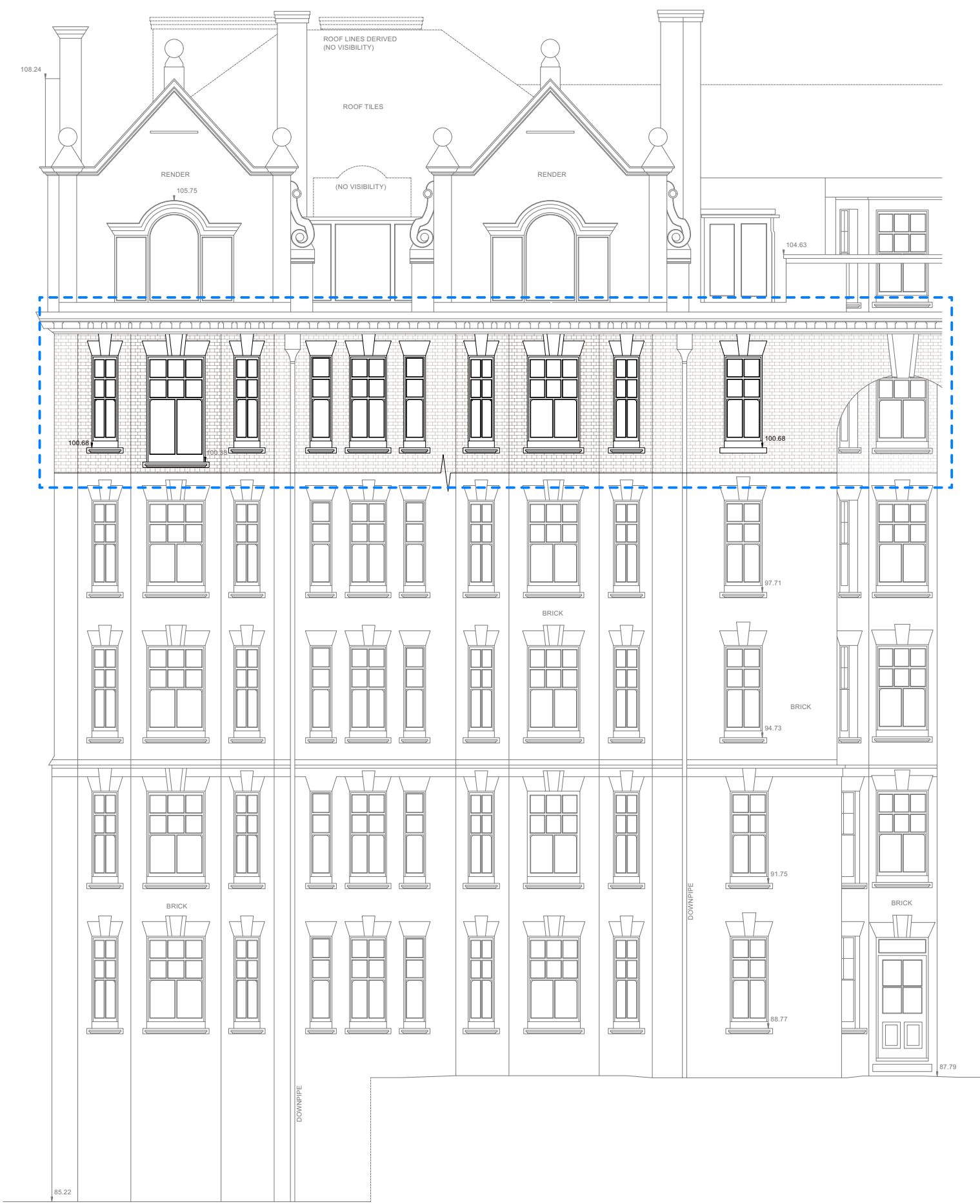
1 Existing North-East Elevation 1:100 @A1