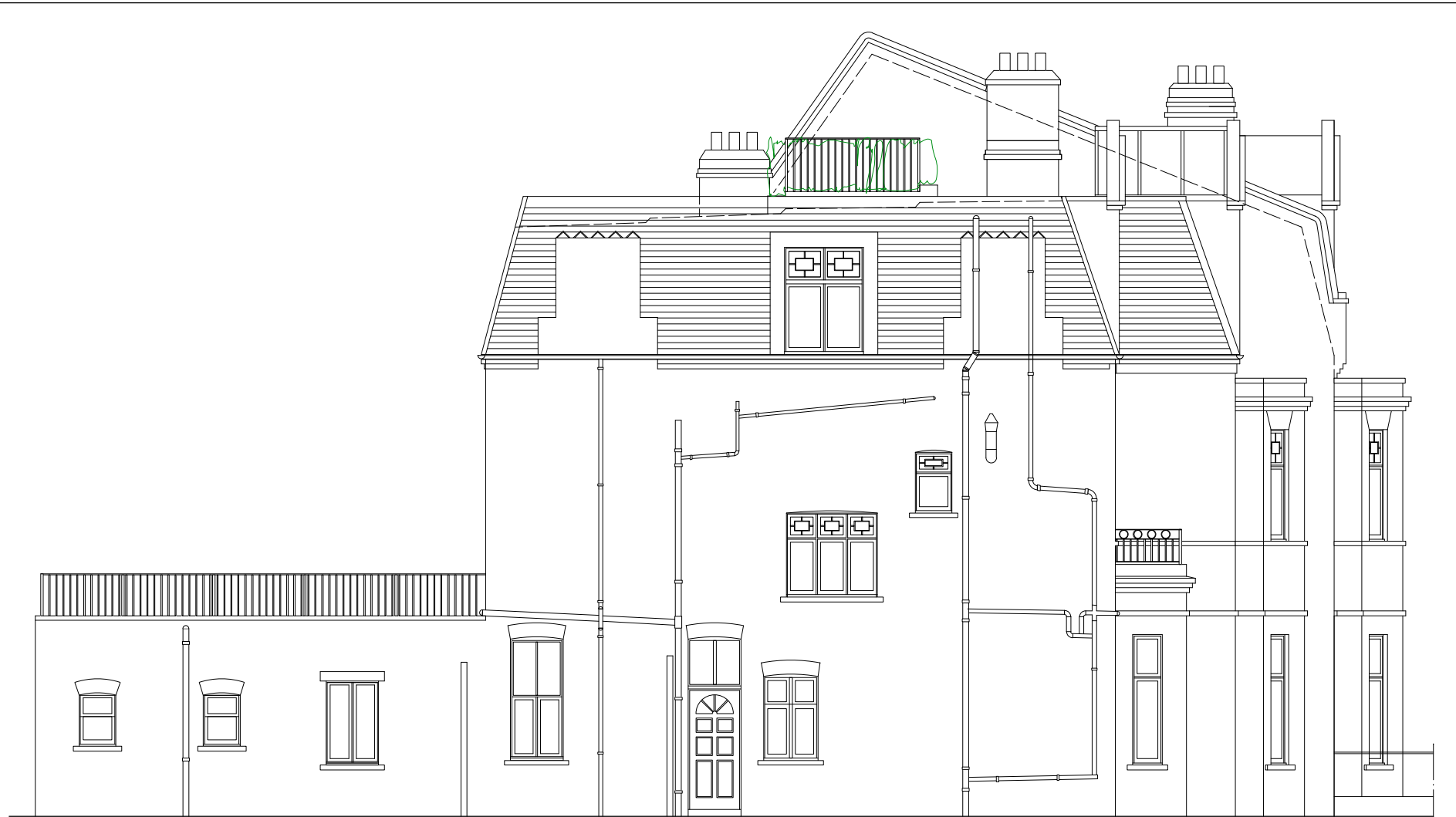
2 Side Elevation Scale: 1:100