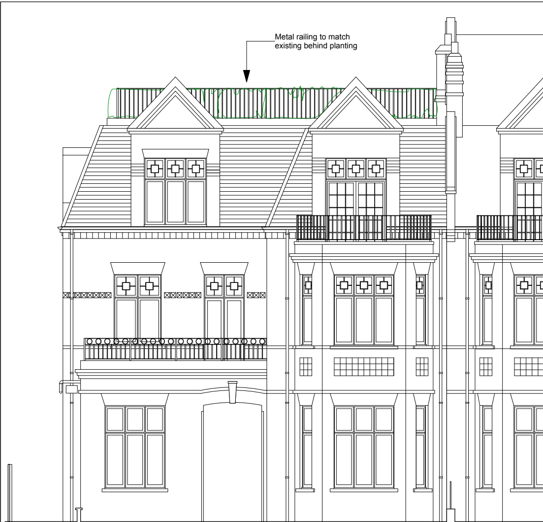
1 Front Elevation Scale: 1:100