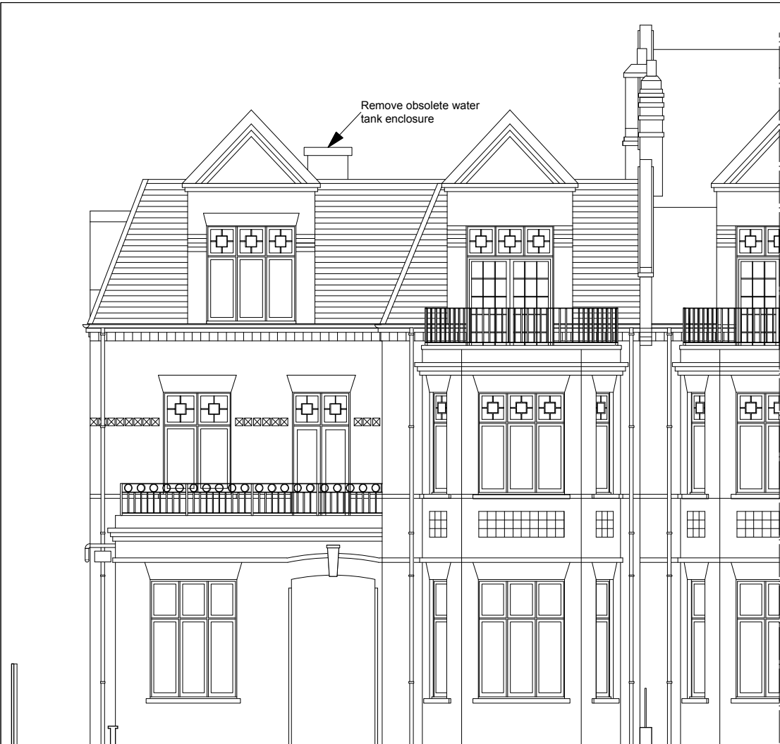
1 Front Elevation Scale: 1:100