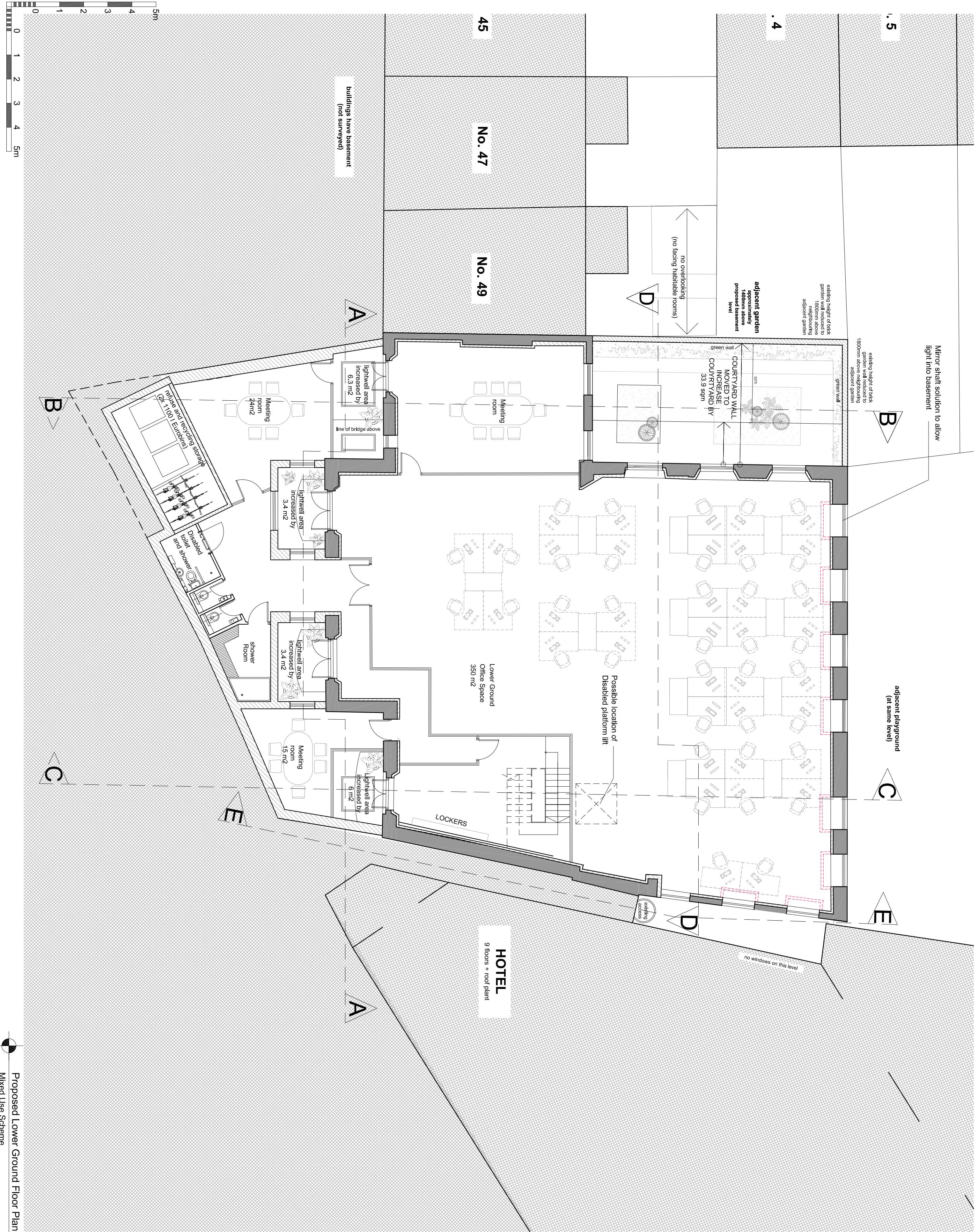
Proposed Lower Ground Floor Plan Mixed Use Scheme

SCALE: 1:100 @ A2 DATE: NOV 2021 STATUS: S73 DRAWING NUMBER: 1308-S73-109 REV: A ISSUED BY: OB DRAWING CODE: XXXX-BNXX-XX-DR-A-XXXXXX-00