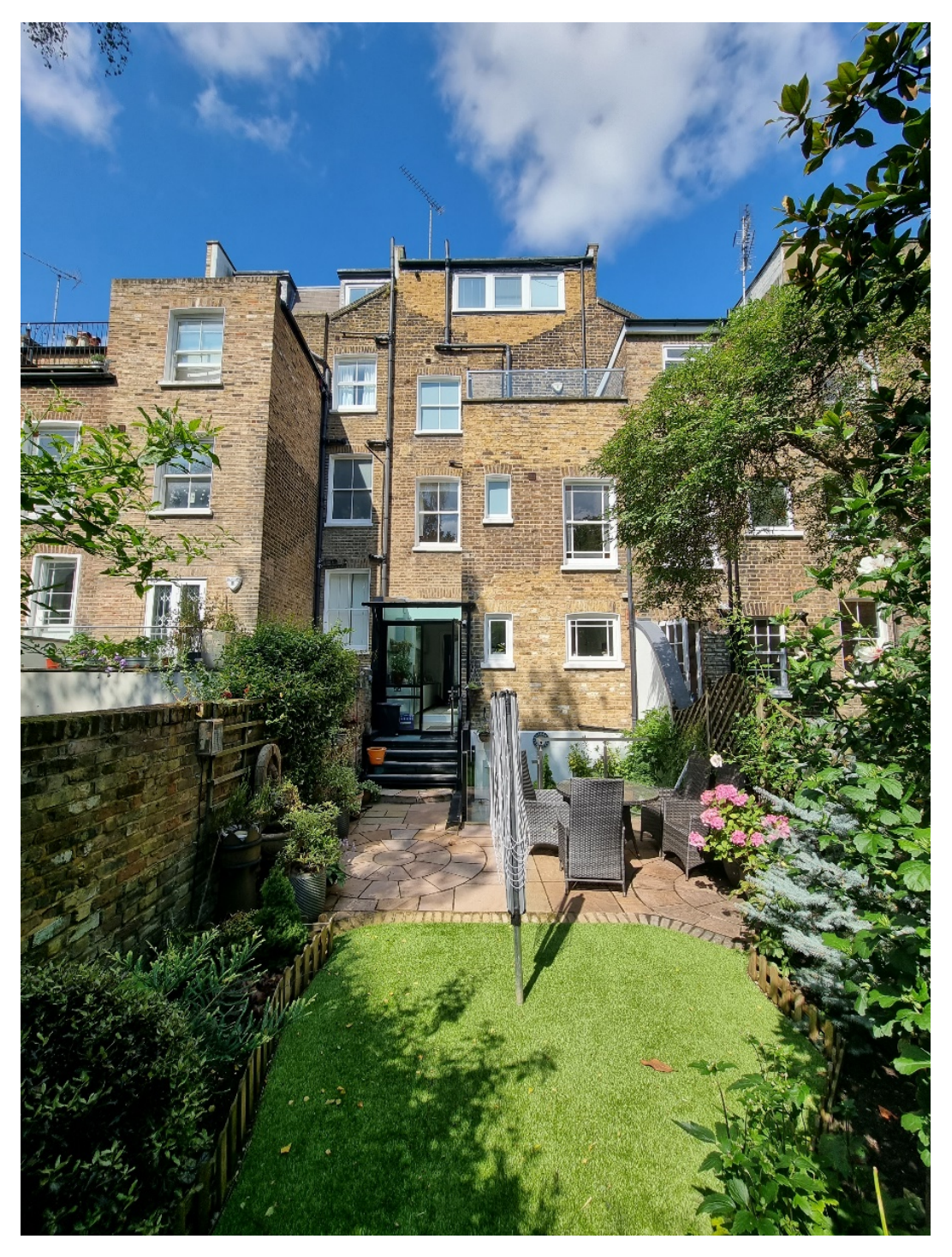
Figure 4 - Photograph of the existing rear facade of No.50

On both neighbouring sides the outriggers are much higher, each of them adding an additional floor over the outrigger at No.50. The stepped heights of No.51 taking the outrigger higher than the neighbour on the other side at No.49. Looking at the rear of the terrace row, there are number of extensions and outriggers of different sizes and depths that vary the heights of the properties and change the language of massing all along the street.