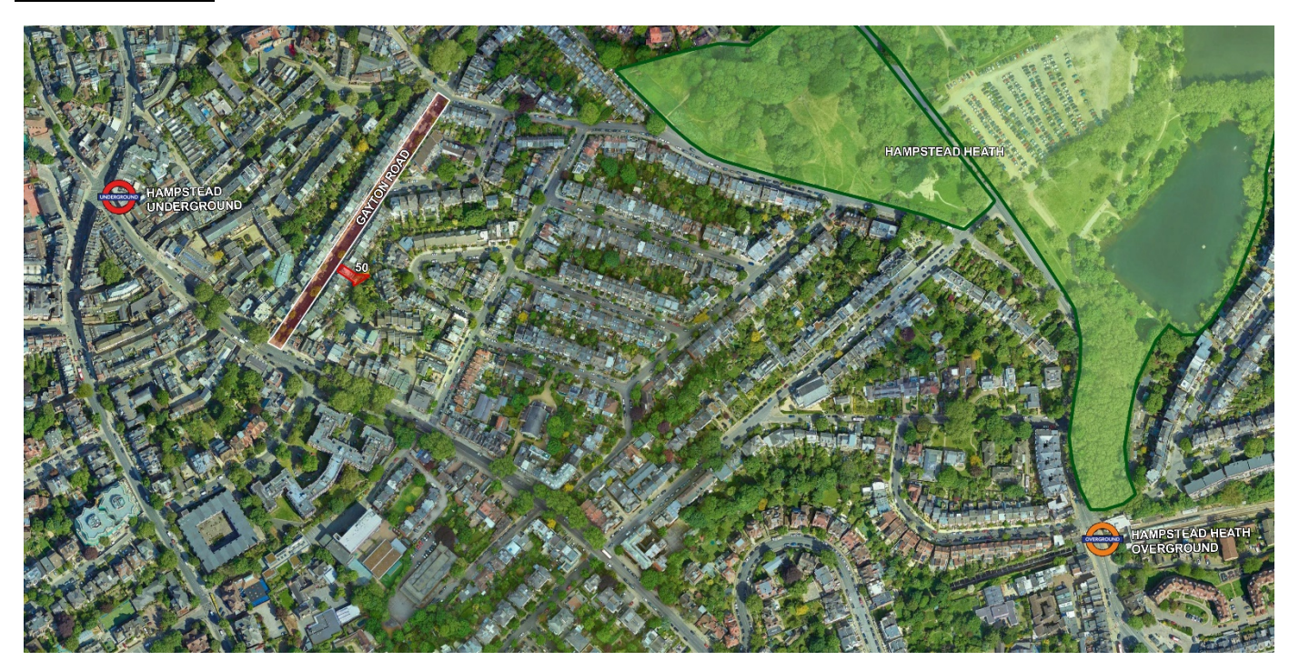
Figure 1 – Aerial View of the Hampstead Area with Gayton Rd highlighted in red and the site also highlighted in red.

Gayton Rd is located in Hampstead, within the Hampstead Road Conservation Area, and forms a link between two roads, access being from Willow Rd and Well Walk at the north east end and Hampstead High Street (A502) to the south west end. No. 50 is located on the southern side of the road and is part of a terrace row comprising multiple properties of varying heights and façade details.