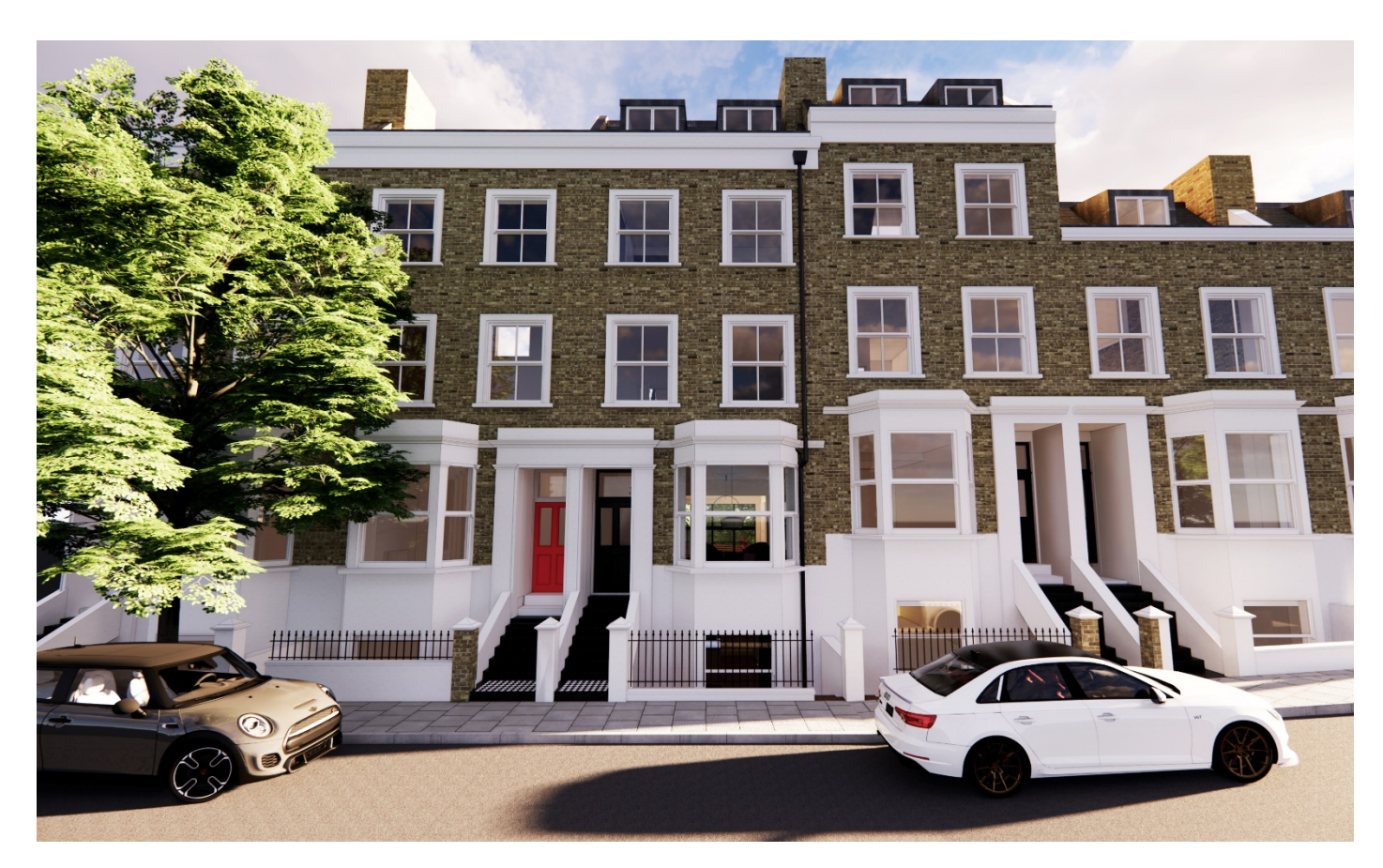
Figure 6 - Illustrated render of the front of the proposed

We are also looking to replace the existing aged rainwater goods with new cast iron pipework in black.