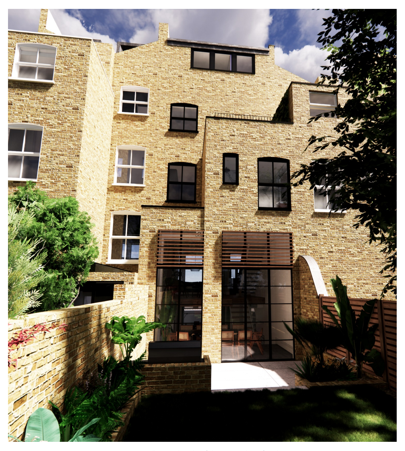
Figure 5 - Illustrated render of the proposed rear facade.