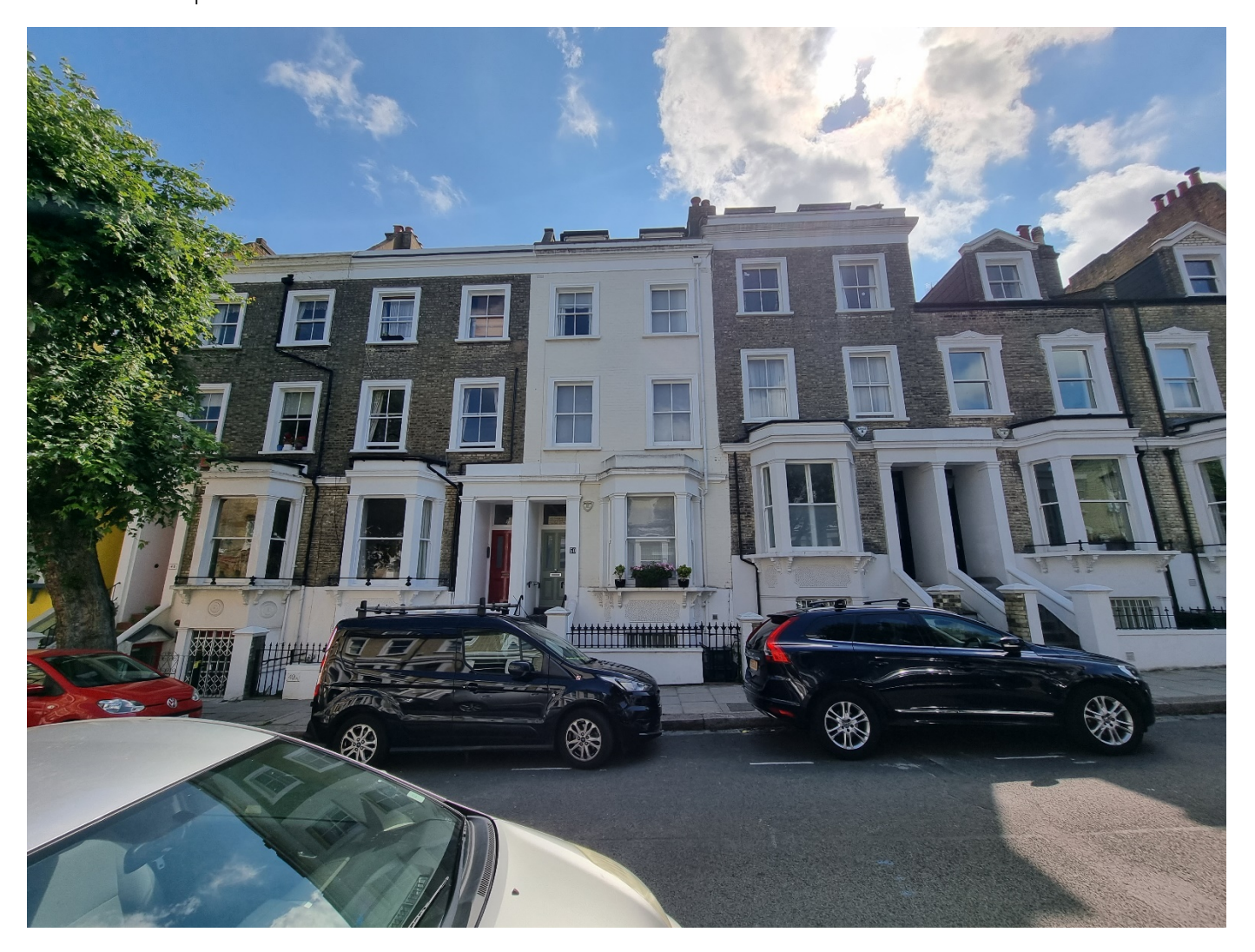
Figure 3 - Photograph of the existing house at No.50 from across the street showing its relationship to the terrace row

Separating the front lightwell and lower ground floor from the pavement, the front boundary wall is white rendered and has a small black wrought iron fence and gate. The piers on either side are mixed in finish, being either white render or white painted or bare brickwork.