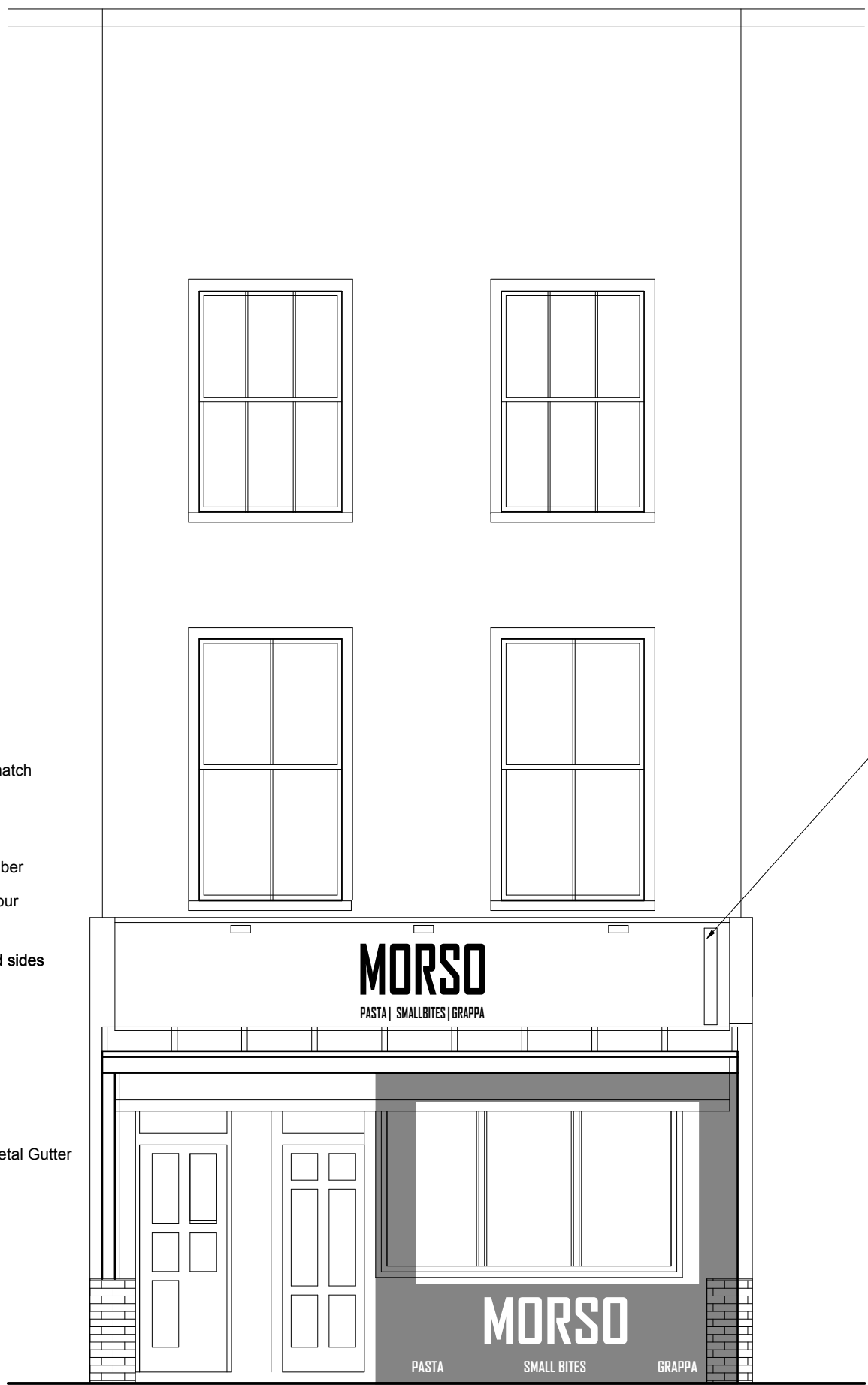
C PROPOSED FRONT ELEVATION S205 1:50