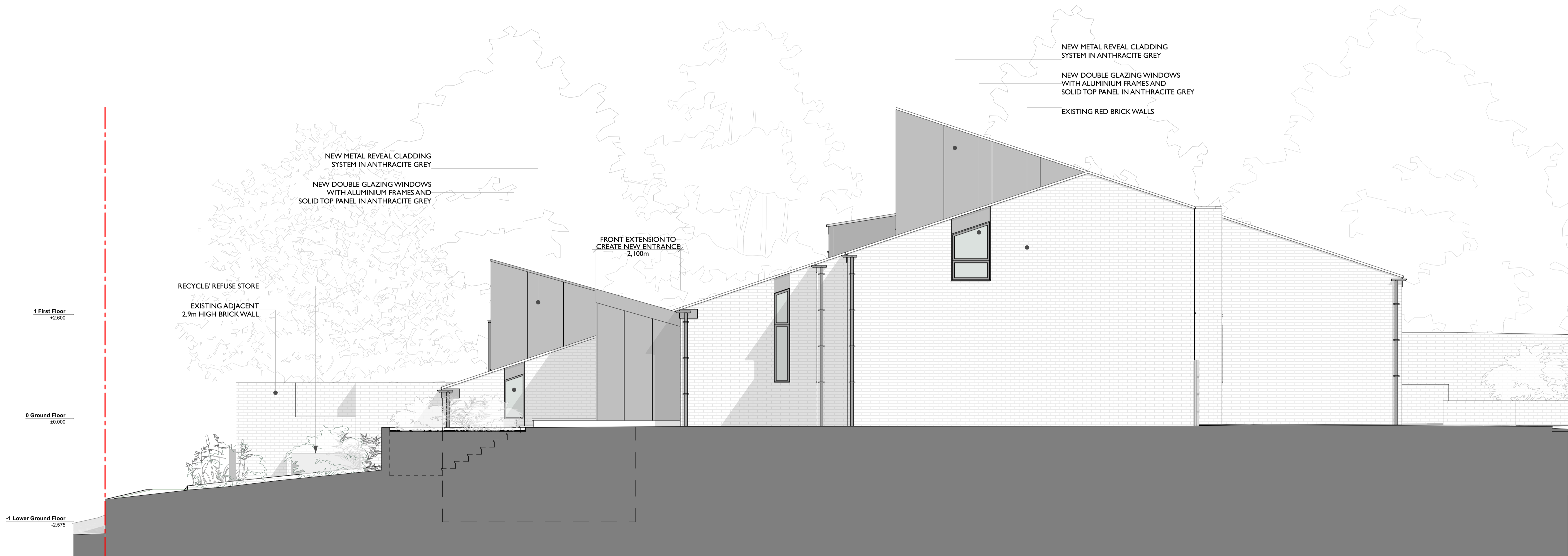
SIDE SOUTH-EAST ELEVATION SCALE 1:50