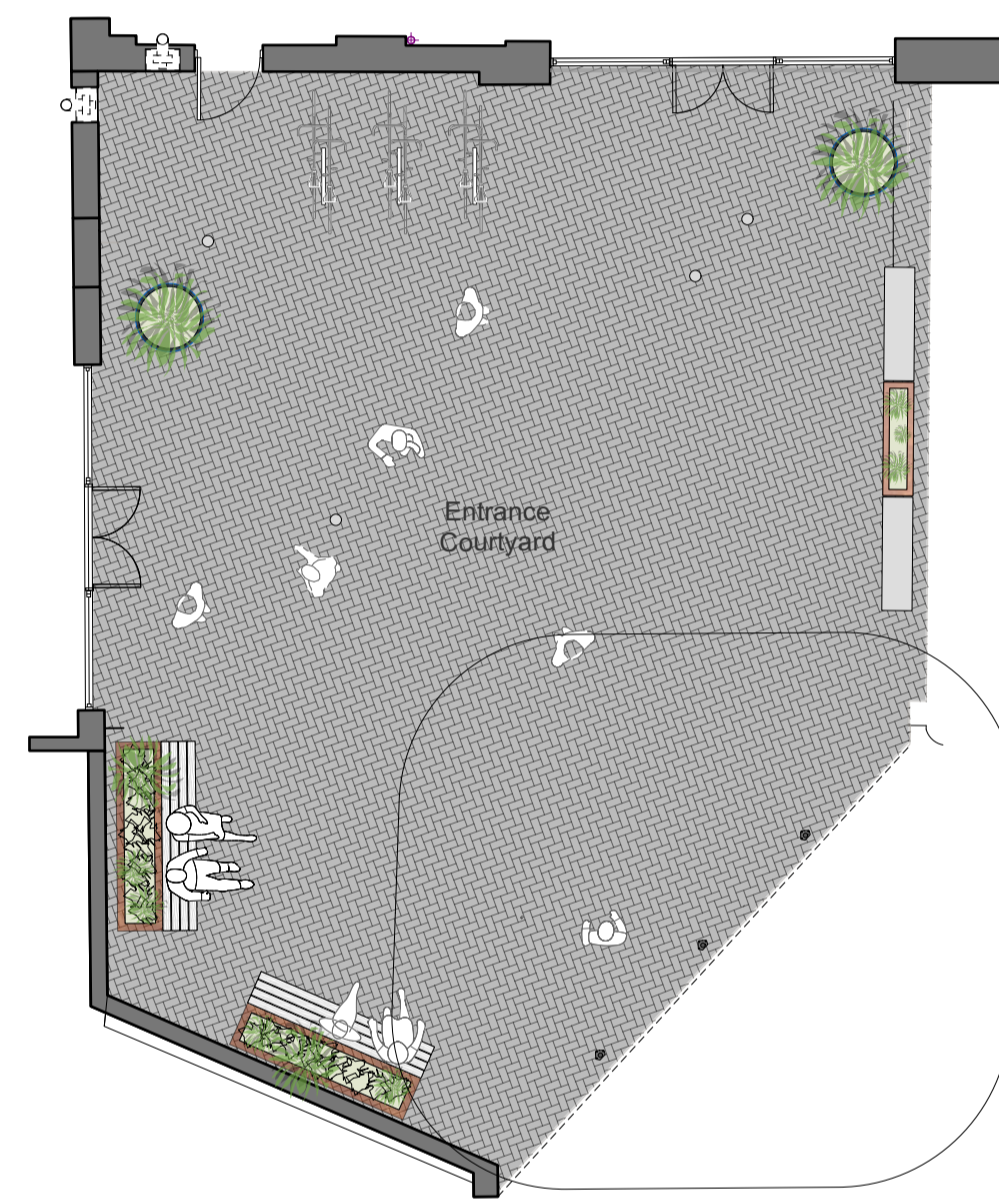
3 Key Plan