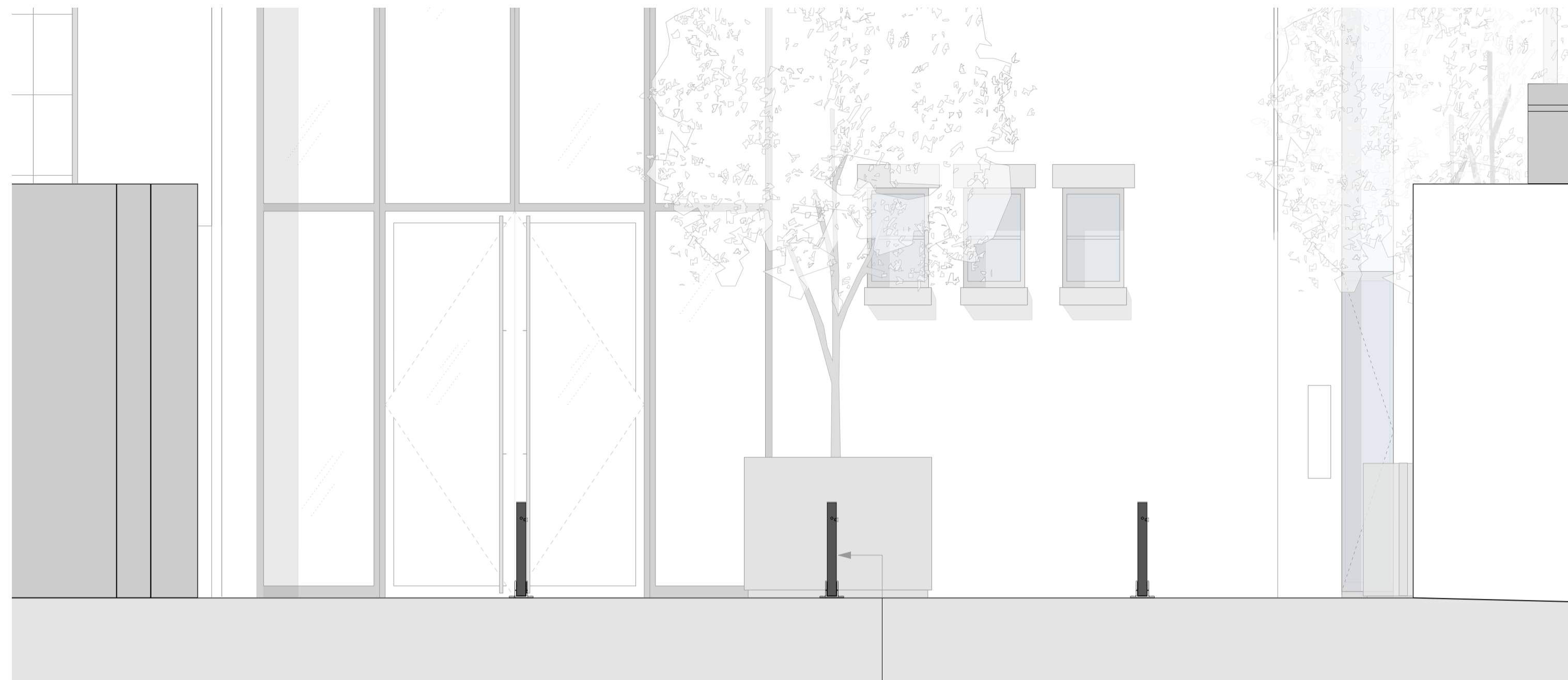
1 Elevation - Entrance to Courtyard Scale: 1:25